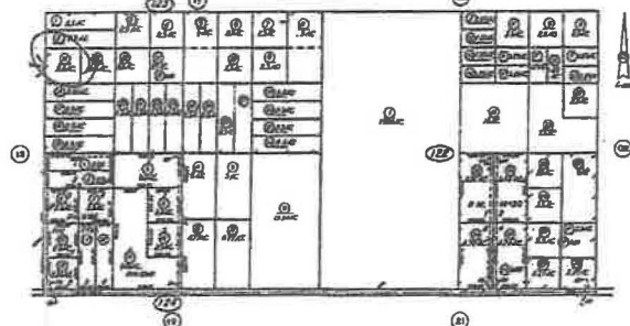
ASSessor MAP NO. 245-12 COUNTY OF KERN