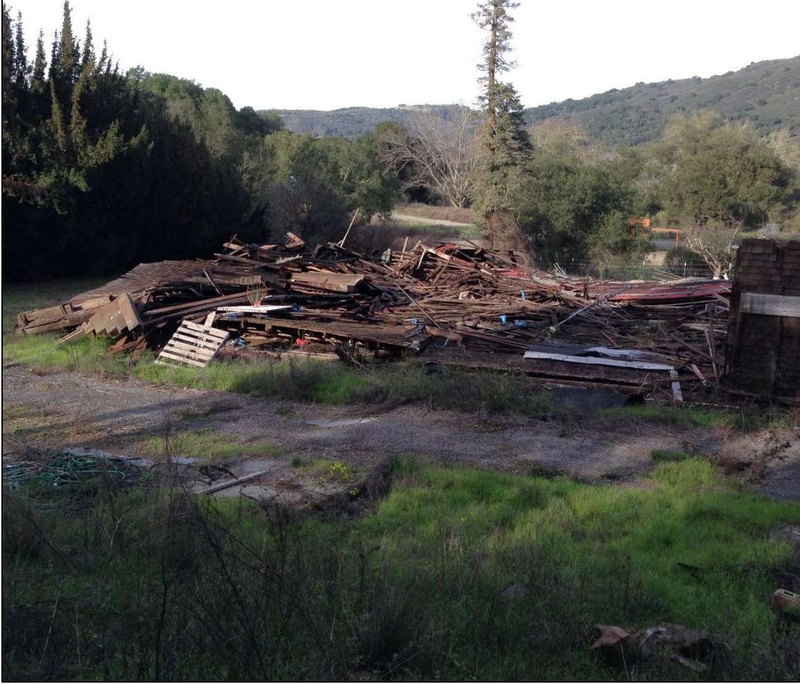
Figure 3: Barn collapse (3/8/2014)