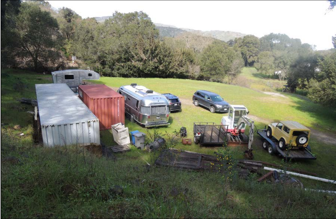
Figure 1: Barn location (2/23/2026)