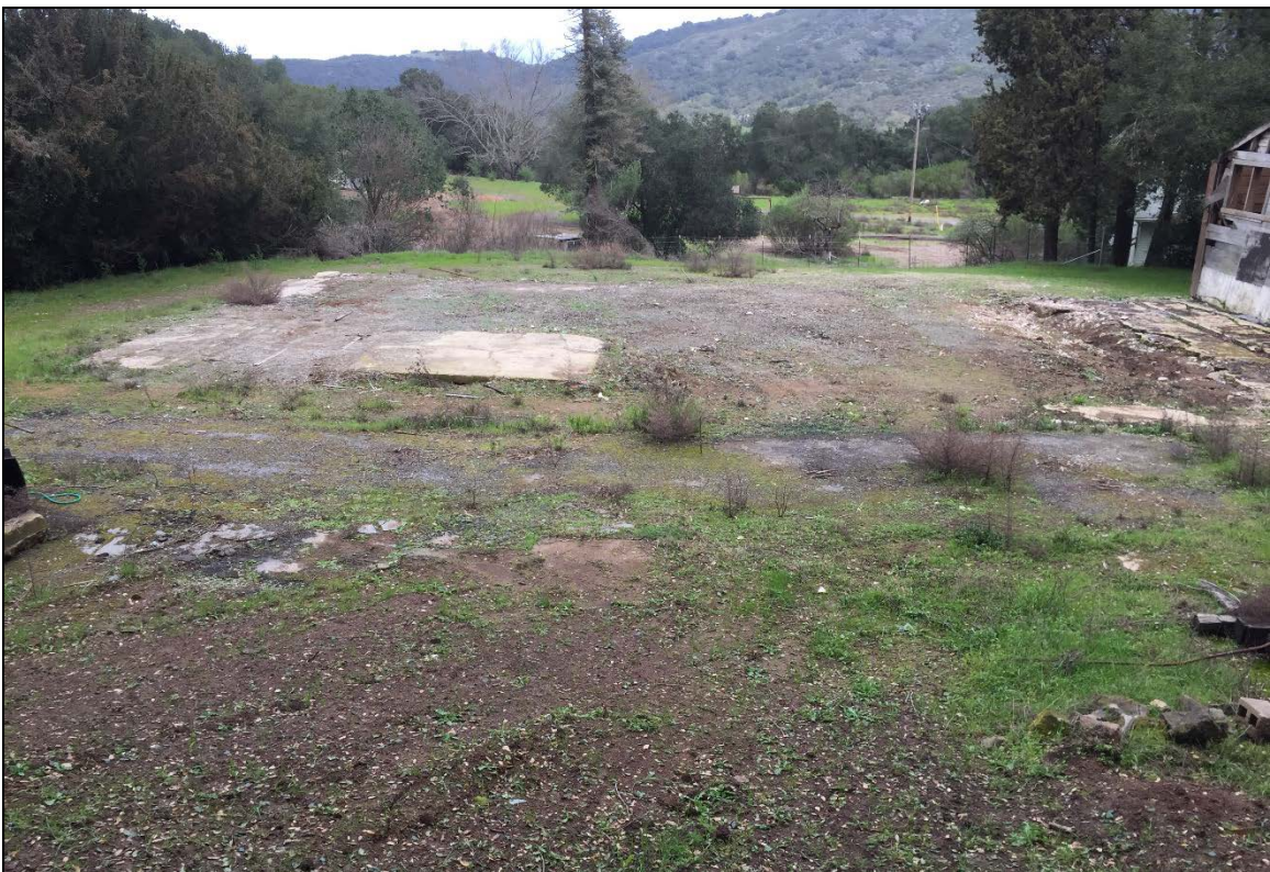
Figure 2: Barn site after removal ((2/19/2016)