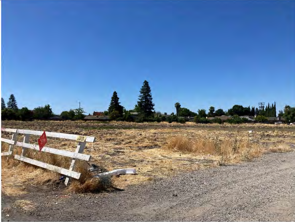
Photo 5. View facing south from southern corner of Rosin Court, south of the project site. The existing residences 500 feet south of the project site are visible. Photo date: 7/9/2025