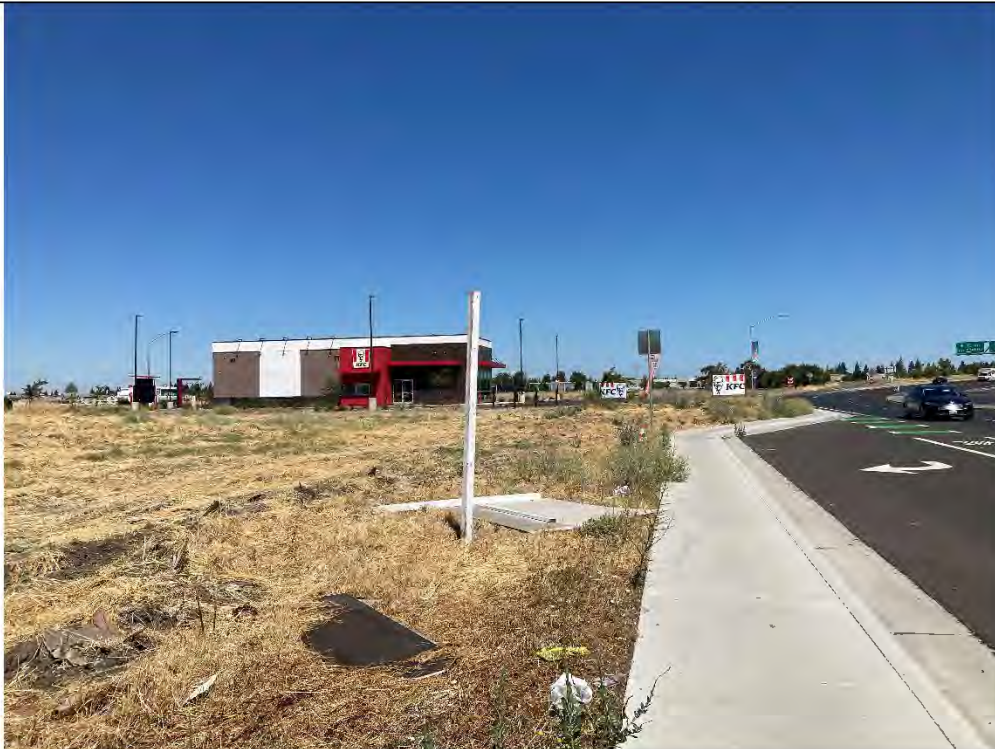
Photo 4b. View facing northwest along the northeastern project site boundary from the eastern corner of the project site. Northgate Boulevard is visible in the right side of the photograph. Photo date: 7/9/2025