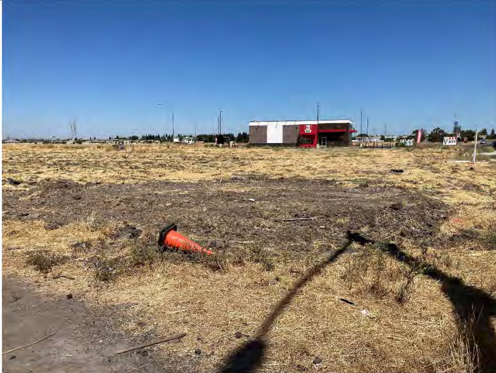
Photo 4a. View of the project site facing west from the eastern corner of the project site. The project site is undeveloped and disturbed. The KFC restaurant northwest of the project site is visible near the center of the photograph, and existing residences 0.4-mile west of the project site are visible in the background, left of the KFC restaurant. Photo date: 7/9/2025