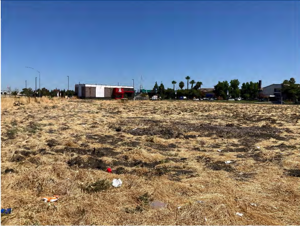
Photo 2b. View of the project site facing north from the southern corner of the project site. The project site is undeveloped and disturbed. The KFC restaurant northwest of the project site and other development east of Northgate Boulevard are visible in the background. Photo date: 7/9/2025