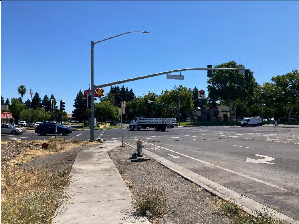
Photo 3. View facing northeast along southeast project site boundary. The intersection with Northgate Boulevard and Rosin Court and surrounding existing development are visible. Photo date: 7/9/2025