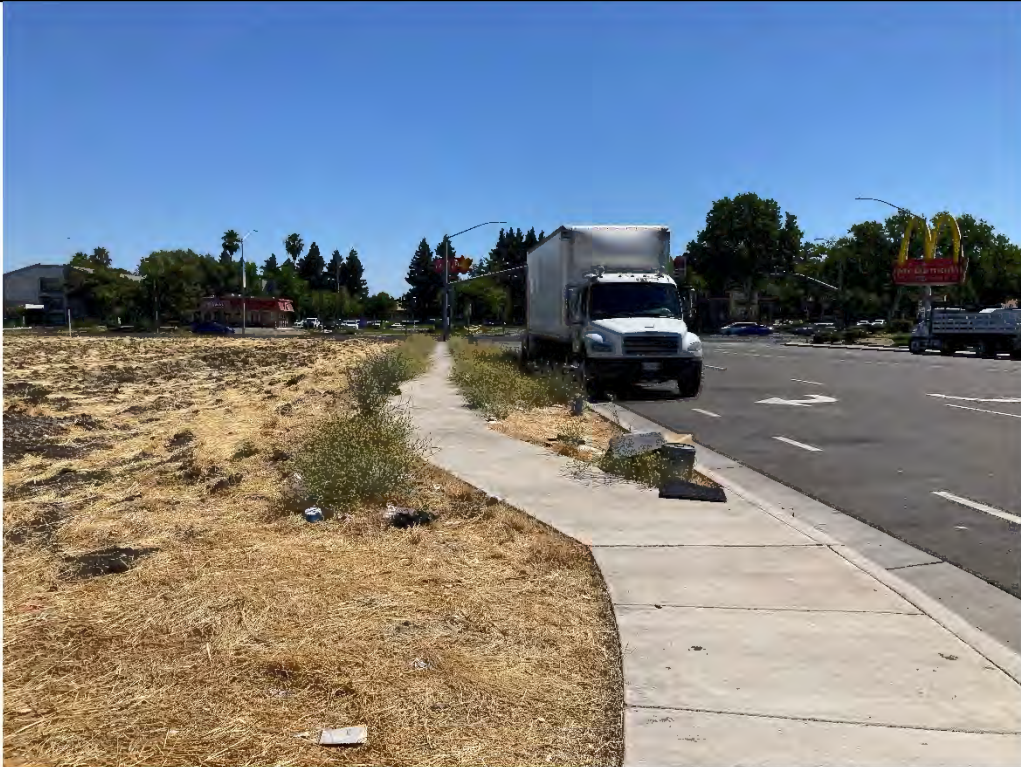
Photo 2c. View facing northeast along the southeastern project site boundary from the southern corner of the project site. Rosin Court is visible in the right side of the photo. Photo date: 7/9/2025