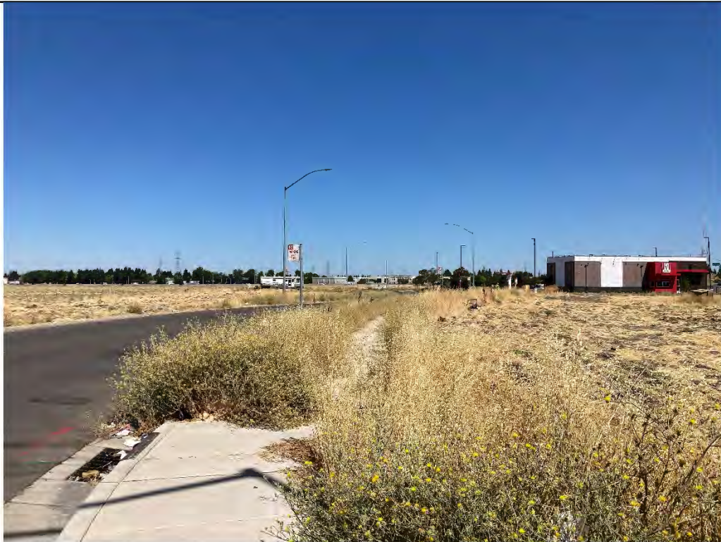
Photo 2a. View facing northwest along the western project site boundary from the southern corner of the project site. Rosin Court is visible in the left part of the photo. Photo date: 7/9/2025