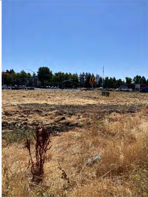
Photo 1. View of the project site facing southeast from the northwest corner of the project site. The site is undeveloped and disturbed. The surrounding development east of Northgate Boulevard and south of Rosin Court are visible in the background. Photo date: 7/9/2025