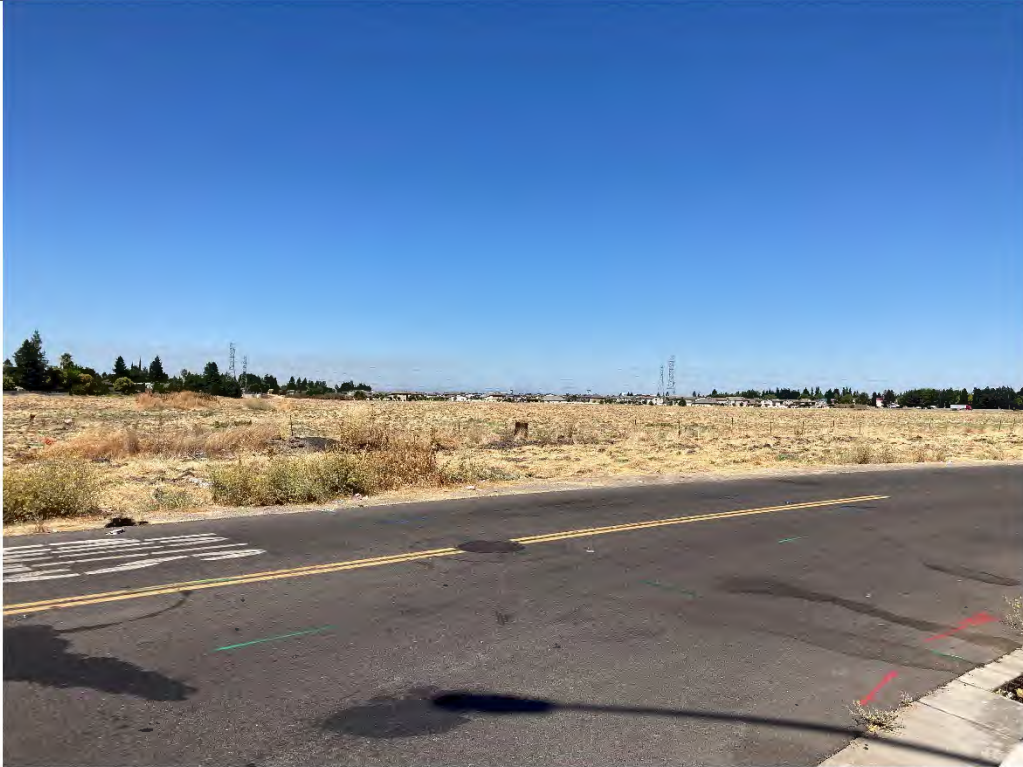
Photo 2d. View facing west from southern corner of the project site. Rosin Court is visible in the foreground, and the undeveloped parcels west of the project site are visible across the center of the photo. Existing residences 0.4-mile west of the project site are visible along the horizon. Photo date: 7/9/2025