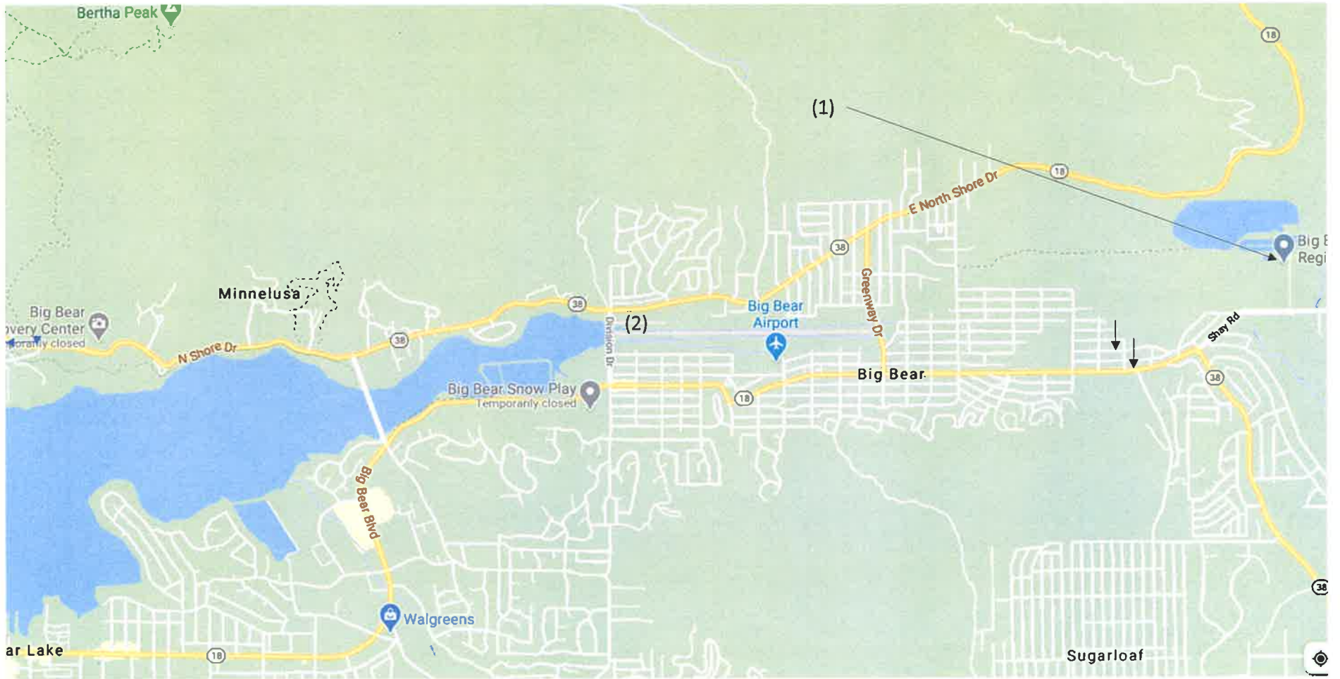
Return Activated Sludge Header Replacement Project Location Map (1)