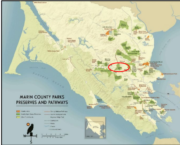
Loma Alta Open Space Preserve Regional Location