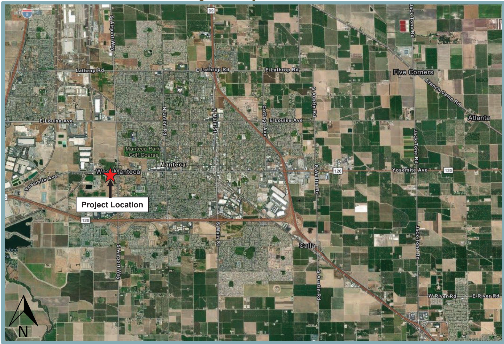
Figure 1 Regional Project Location