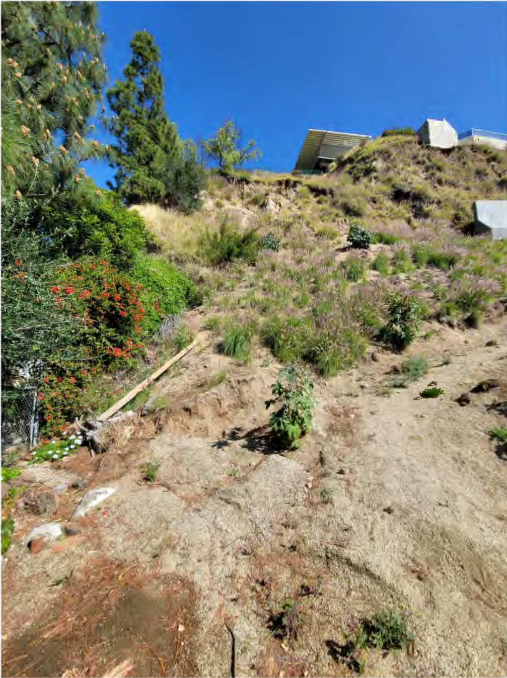
1501 Marlay Dr. Site Photos