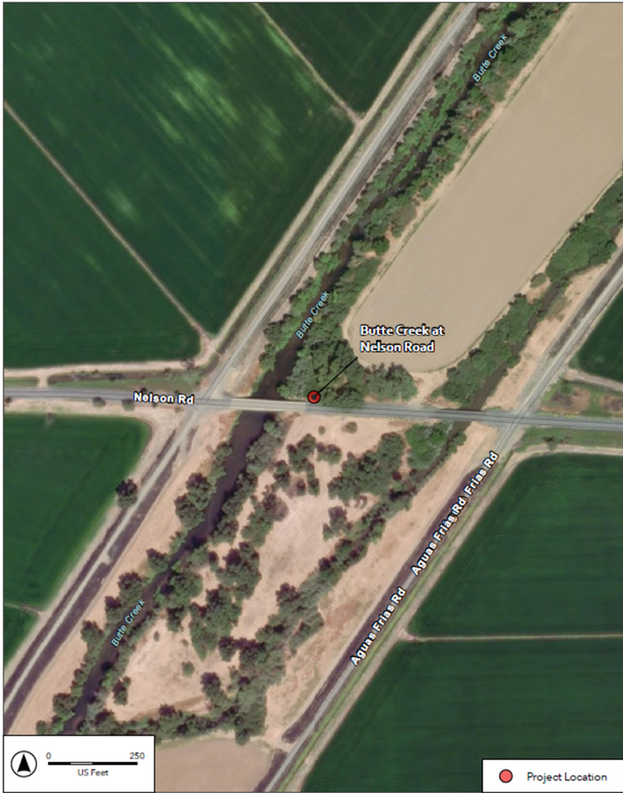
Figure 3. Butte Creek at Nelson Road Site Location