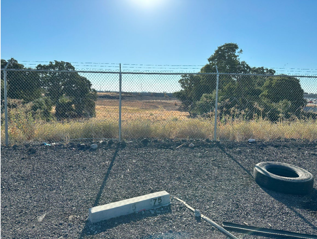
AREA BETWEEN TWO GROVES FOR PROPOSED DRIVEWAY

PHOTOS TAKEN BY ED STIRTZ ON AUGUST 9, 2023