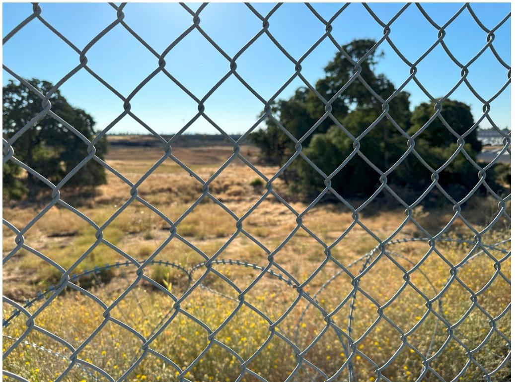
CLOSER VIEW OF AREA BETWEEN TWO GROVES