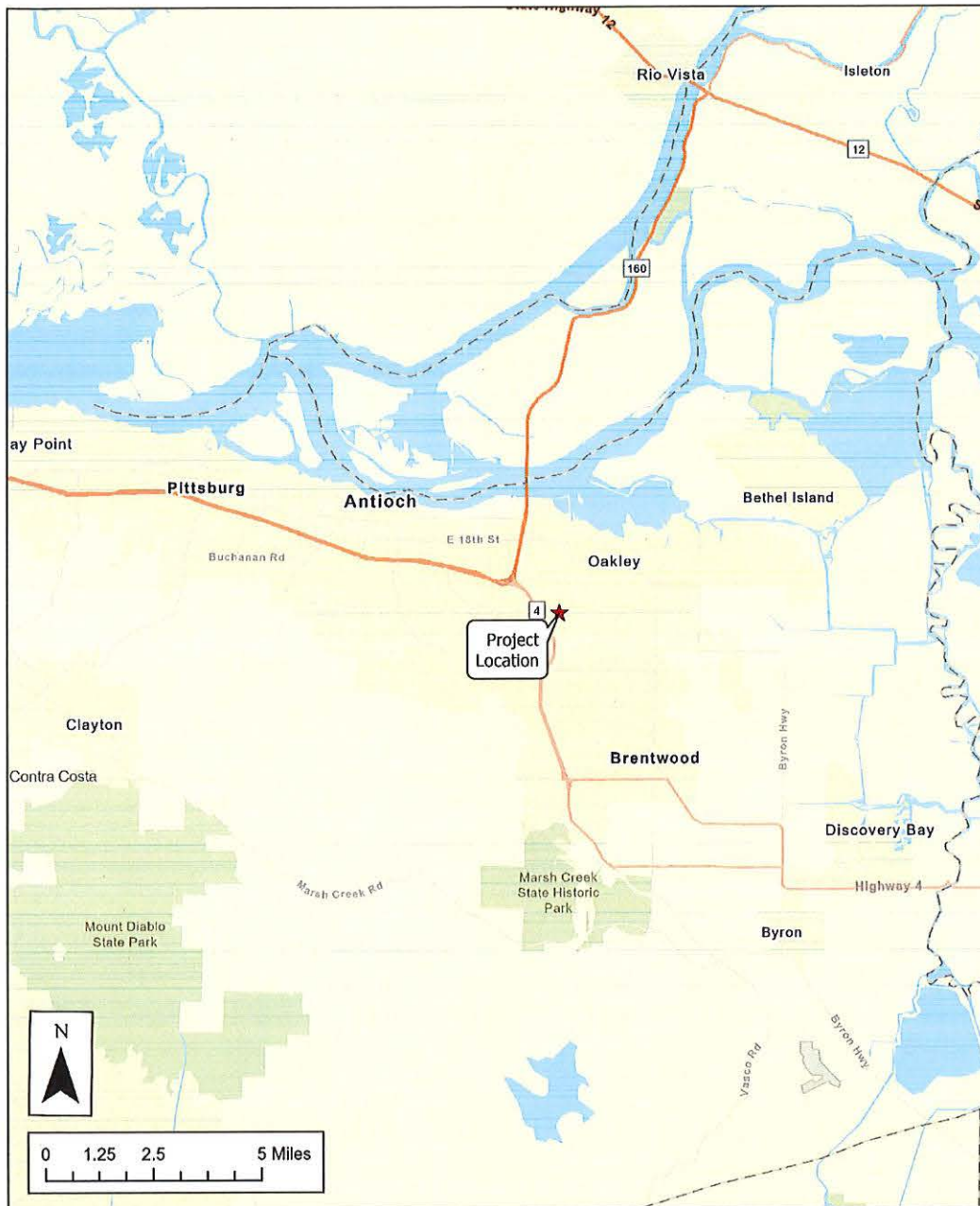
Figure 1. Vicinity Map Randall-Bold Water Treatment Plant Clearwell, Chemical Feed, and Sedimentation Basin Improvements Project