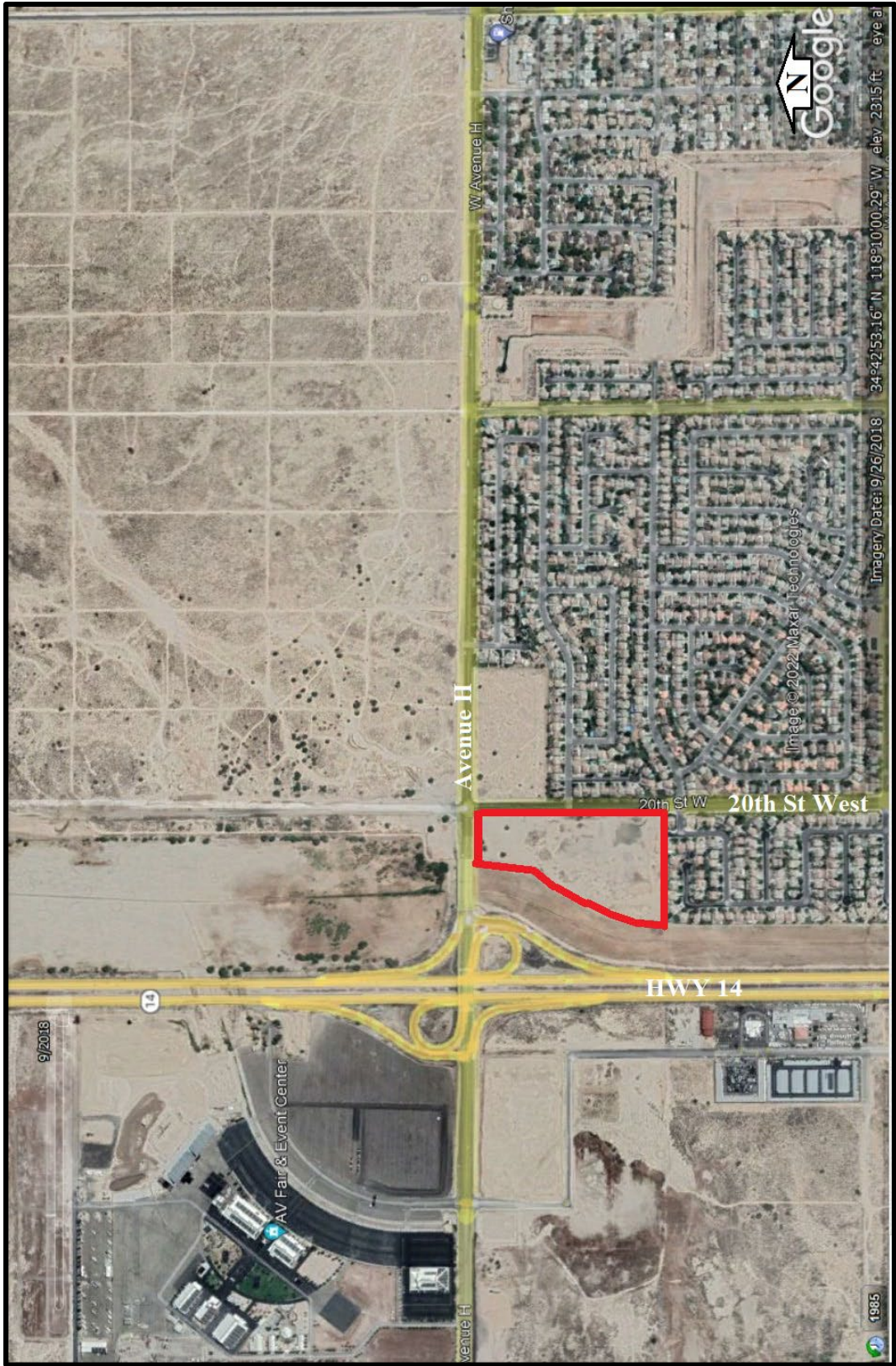
Figure 3. Approximate location of study area, Google Earth 2018, showing surrounding land use.