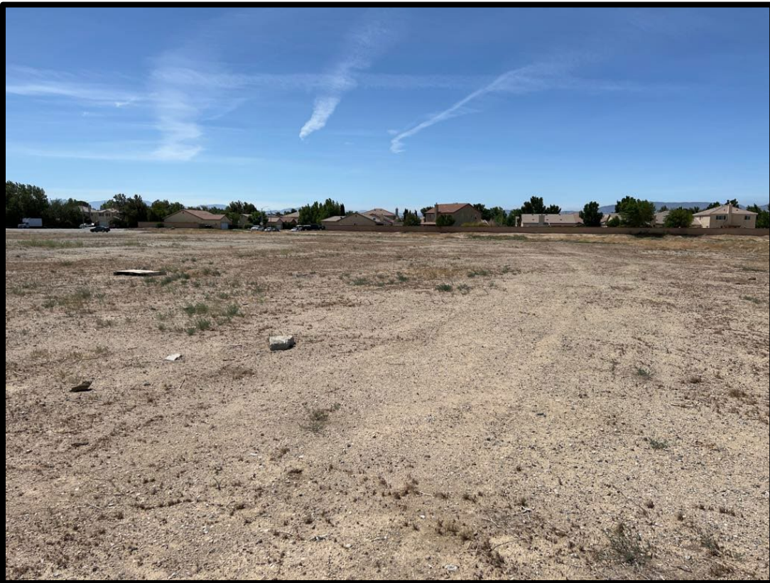
Figure 4. Representative photographs of the study area. Both views are same location in center of study site; top view looking north, bottom looking south.