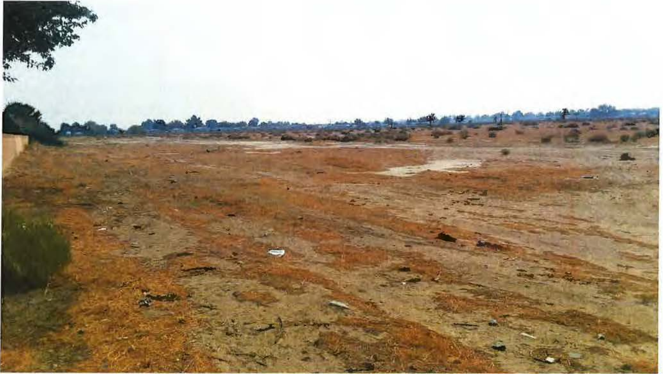
Figure 3 Project Area, View to the Southwest