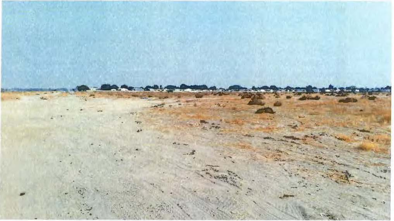
Figure 2 Project Area, View to the East