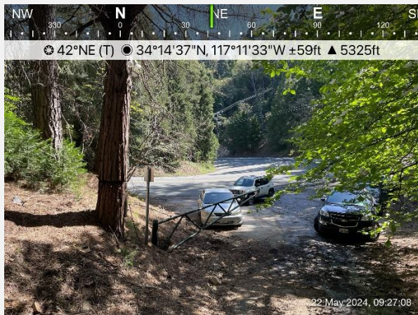
Photo 1. Facing north towards proposed off-site water line trench route.