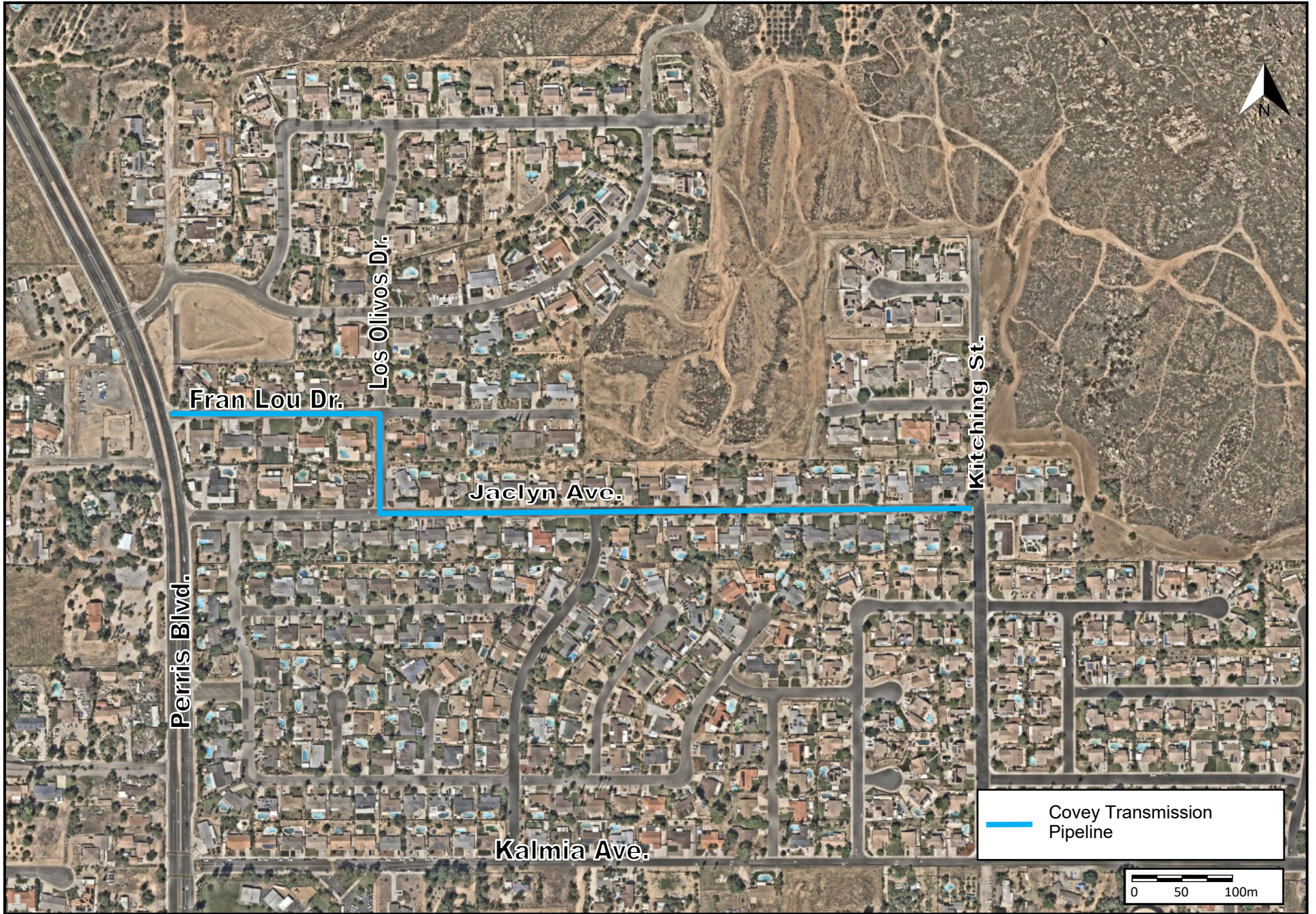
Covey Transmission Pipeline