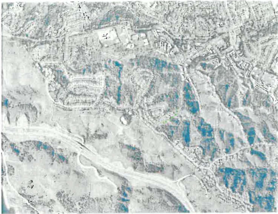
Rambler Trail, Waterdog Lake Open Space