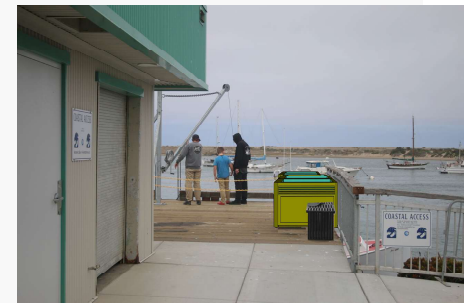
PROPOSED VIEW LOOKING WEST W/ B'+ ACCESS