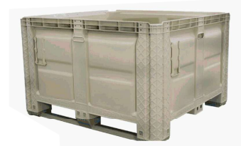
48"x42"x30" FISH CONTAINER