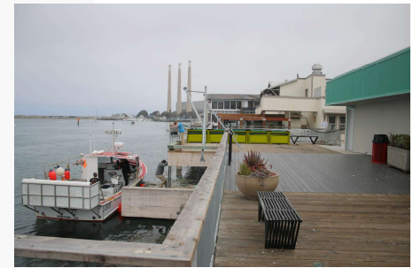
PROPOSED VIEW LOOKING NORTH W/ 2 INTERPRETIVE SIGNS