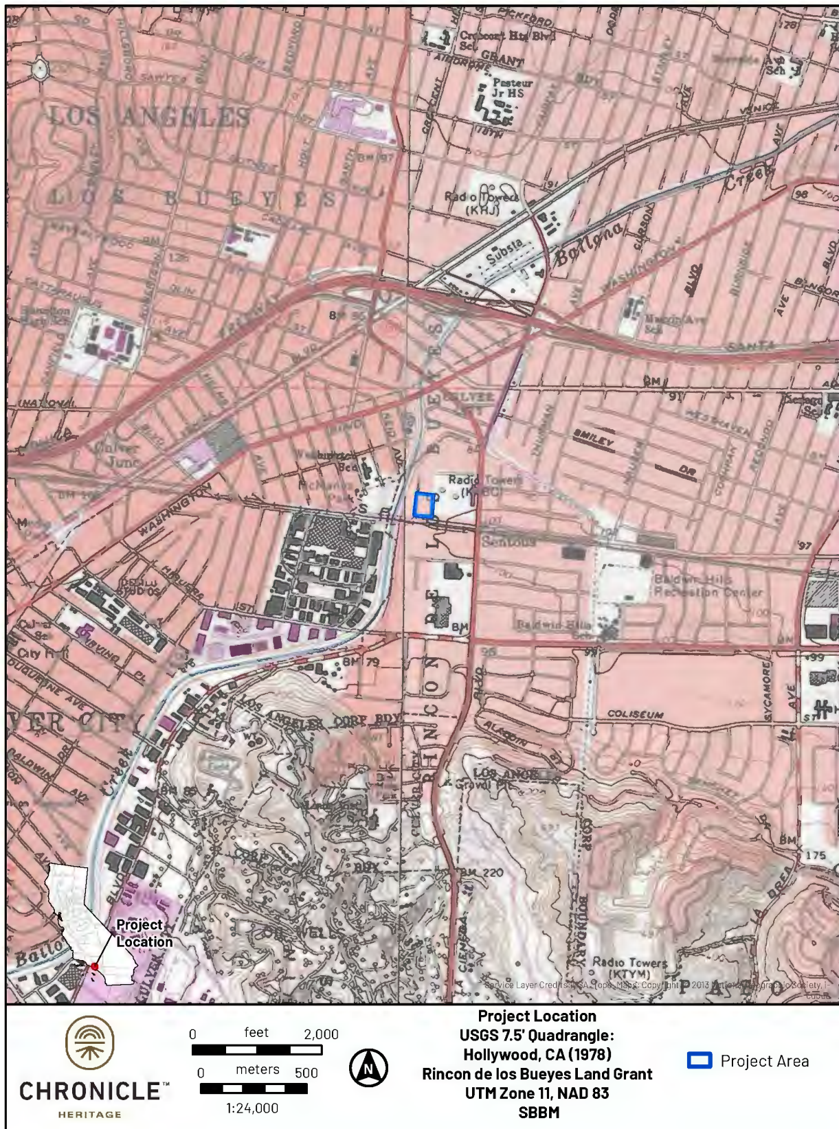
Figure 2. Project location map.