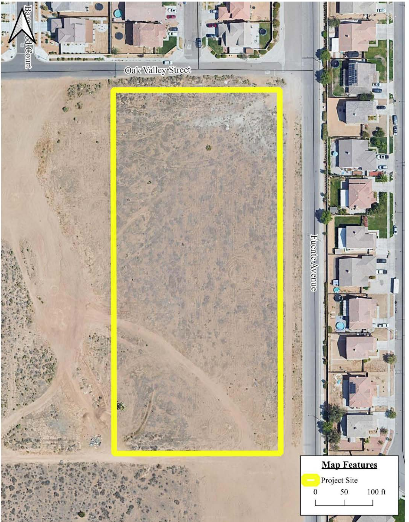
Figure 1 – Project Location