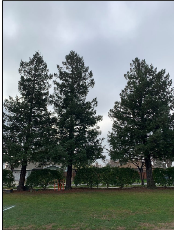
Photo 1: Coast redwoods #93 – 95 (left – right) were in good condition.

Of the 41 coast redwoods, 37 were in good condition while four were fair and #62 was poor. Condition varied with tree health, signs of water stress, and overall vigor. Redwoods in good condition had full, dense crowns (Photo 1). Fair condition redwoods had slightly thin foliage and moderate structural deficiencies such as a sweeping trunk and/or codominant trunks. Redwood #62 had more severe thinning. Development stage was a mix of young to mature, indicated by individual trunk diameters ranging from 8 to 57 inches. Most were intermediate with diameters between 20 – 25 inches, located in a dense row along the perimeter of the sports field.