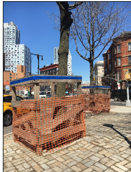
Figure 1: An example of trunk protection measures in the public right-of-way.