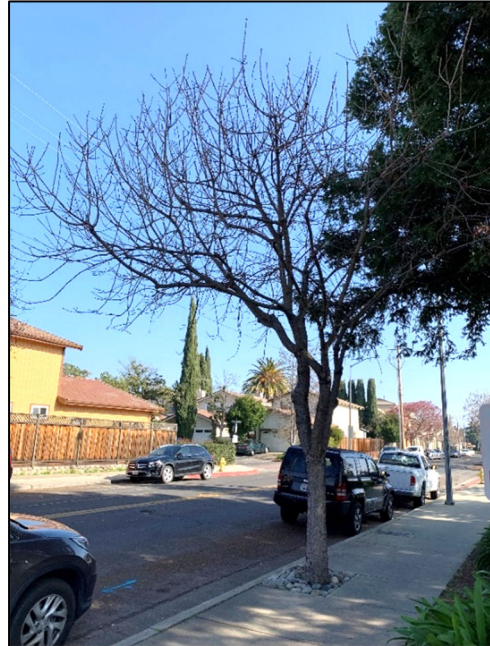
Photo 3: Chinese pistache #168 was in fair condition, having developed a one-sided crown due to competition for space with a nearby redwood.

Sixteen (16) Chinese hackberries were street trees along Rincon Avenue. Thirteen (13) were in fair condition, having multiple attachments at approximately 6-feet and being moderately suppressed by the row of larger redwoods along the field to the north. Hackberry #151 was in poor condition with a history of stem failure. All were semi-mature in development with diameters between 6 – 12 inches.