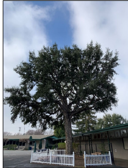
Photo 5: Cork oak #109 was in good condition with a well-structured, decurrent growth habit.