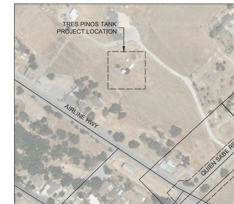
TRES PINOS TANK SITE MAP NTS