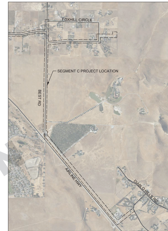
SEGMENT C PROJECT MAP NTS