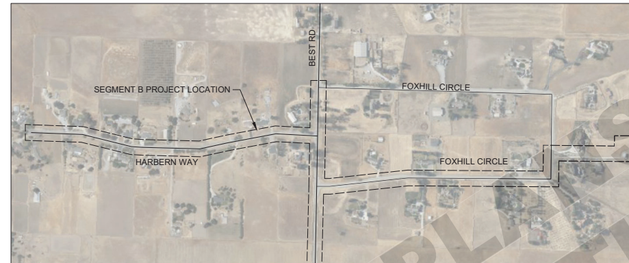
SEGMENT B PROJECT MAP NTS