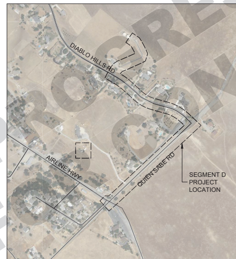
SEGMENT D PROJECT MAP NTS