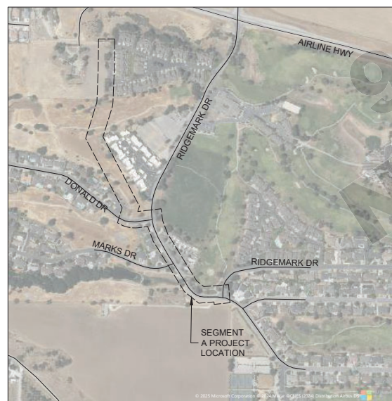
SEGMENT A PROJECT MAP NTS