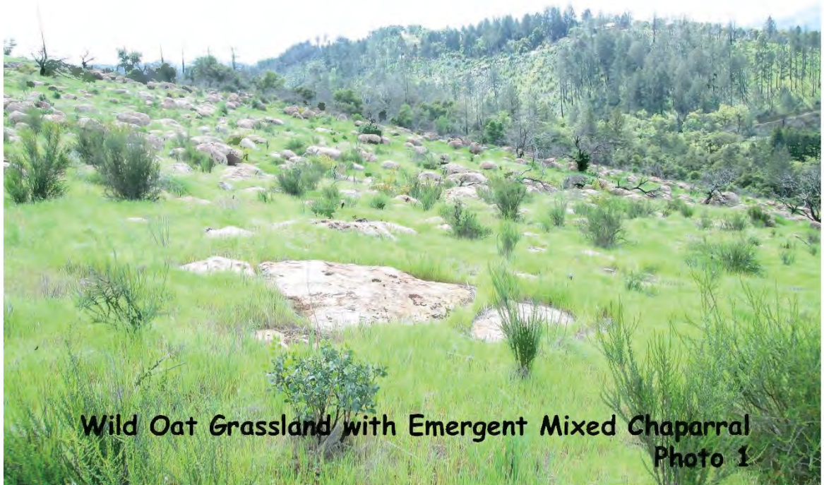
Wild Oat Grassland with Emergent Mixed Chaparral Photo 1