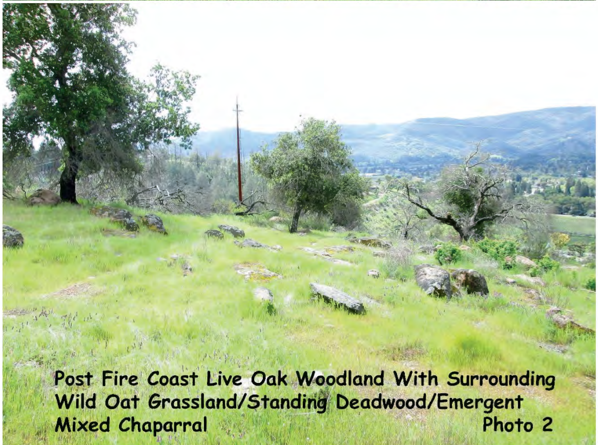
Post Fire Coast Live Oak Woodland With Surrounding Wild Oat Grassland/Standing Deadwood/Emergent Mixed Chaparral Photo 2