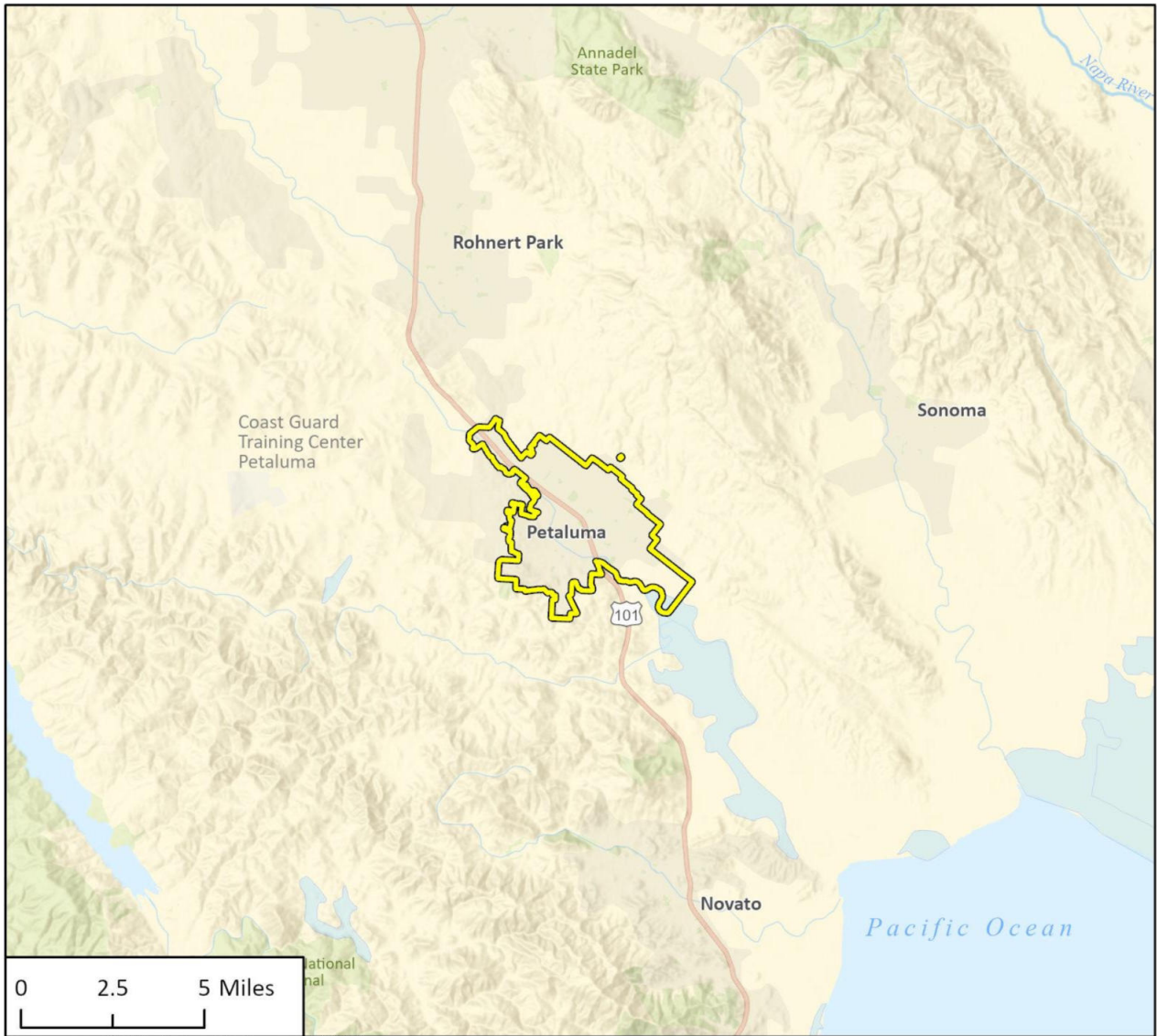
Figure 1 Regional Location