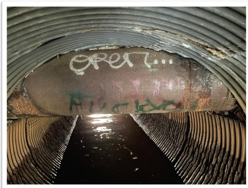
Figure 4. A utility pipe running perpendicular through the culvert has the potential to catch storm debris. Taken near the outlet, facing upstream, March 18, 2026.