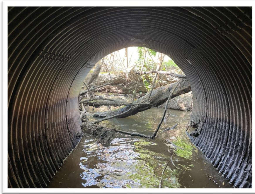
Figure 3. Culvert inlet is partially obstructed by large branches. Note rust line located mid-wall and rusted out areas at water level. Taken facing upstream toward the inlet, March 18, 2026.

Deirdre Clem, Project & Space Analyst California State Polytechnic University at Humboldt March 27, 2026 Page 6