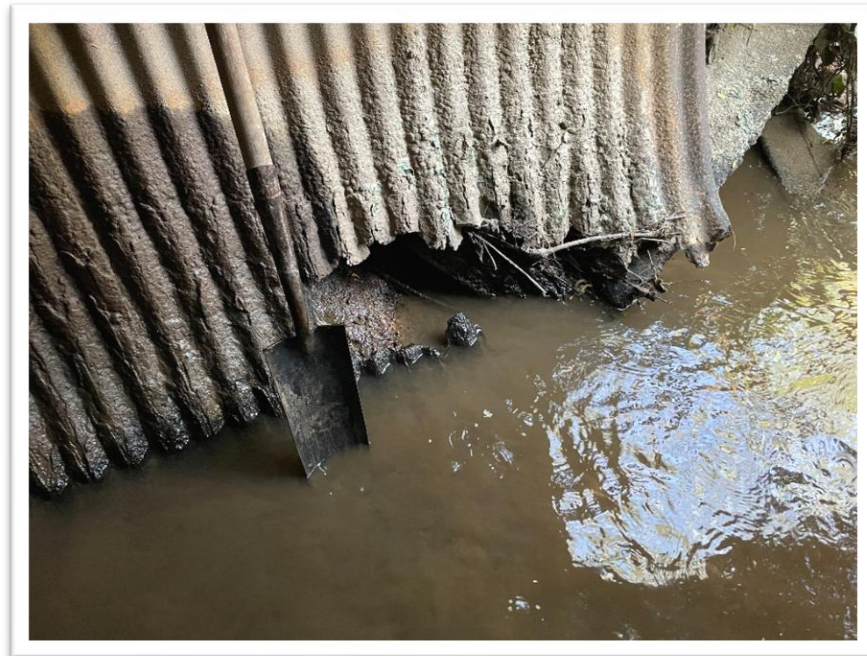
Figure 2. Section of rusted out culvert wall where flows have begun to erode earthen fill materials. Taken at the outlet (shovel included for scale), March 18, 2026.