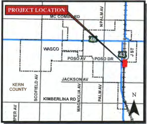
CITY VICINITY LOCATION