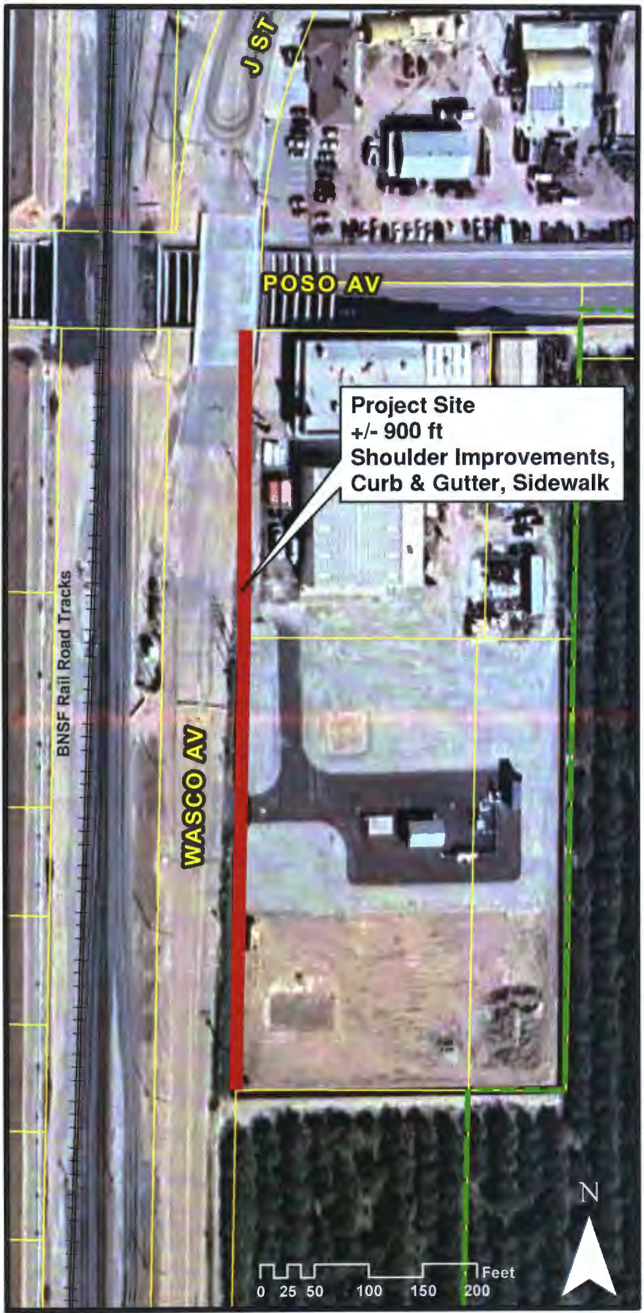
Project Site Map