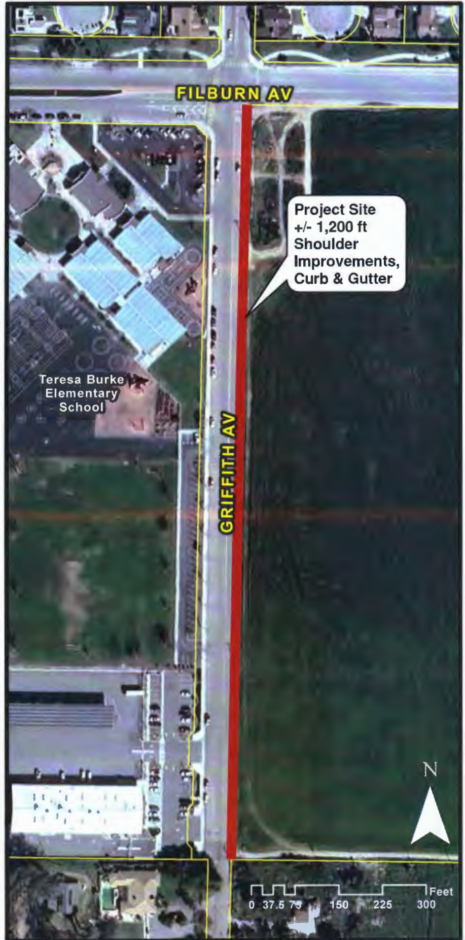
Project Site Map