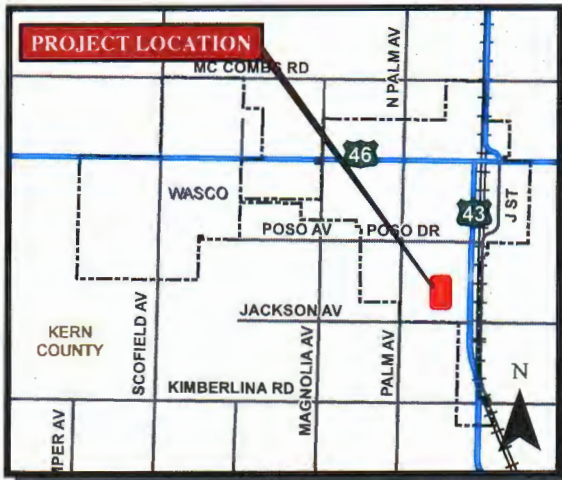
CITY VICINITY LOCATION