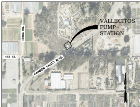
VALLECITOS LOCATION MAP SCALE: NONE