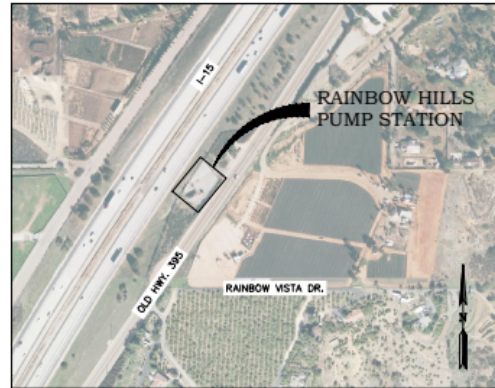
RAINBOW HILLS LOCATION MAP SCALE: NONE