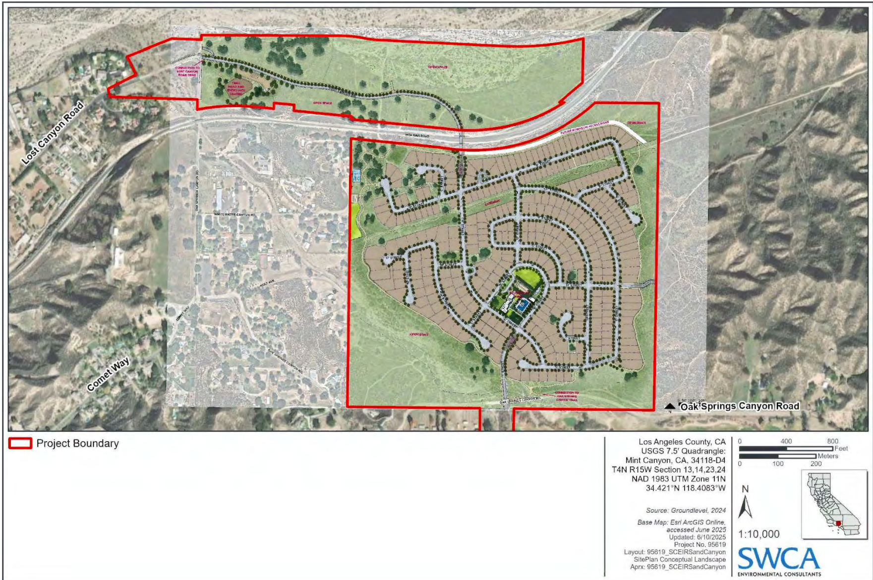
Figure 2. Conceptual Site Development Plan.