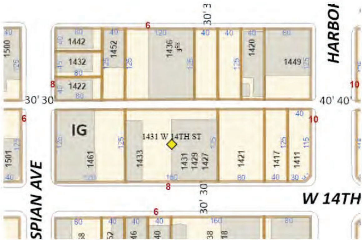
Figure 1 – Vicinity & Aerial Map