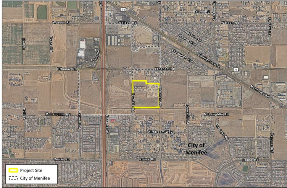
Figure 1 Local Vicinity Map