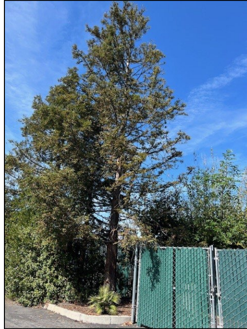
Photo 5. Coast redwood #111 was in fair condition with a thin crown and browning leaves.

Eight bronze loquats were mostly found on the north side of the south building. They had small crowns with multiple attachments at 6 feet. The trunk diameters ranged between 4 – 9 inches with an average of just under 7 inches. Six loquats were in fair condition, #213 was poor with major branch dieback and #216 was in good condition with a larger, full crown.