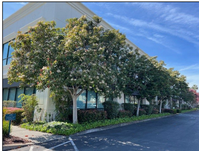
Photo 6. Bronze loquats #218 (L) – 216 (R) were in either fair or good condition with fair form.

The remaining six species were each represented by two or fewer trees. These included: