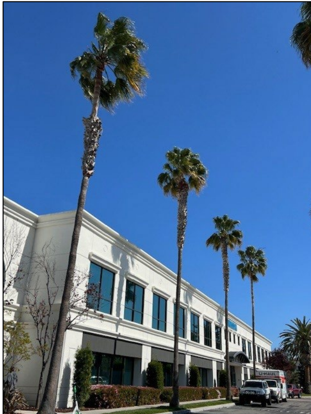
Photo 2 (left). Mexican fan palms #81 (L) – 78 (R) were in fair condition with long, slender trunks and full pineapple crowns.

Forty-five (45) Mexican fan palms were growing either adjacent to buildings or lining the parking lots. Of the 45 palms, 38 were in fair condition with good leaf color and typical fan palm form of a long, slender trunk and pineapple crown (Photo 2). Seven (7) palms were in good condition with green fronds and full crowns. The palms had between 40-50 feet of brown trunk.