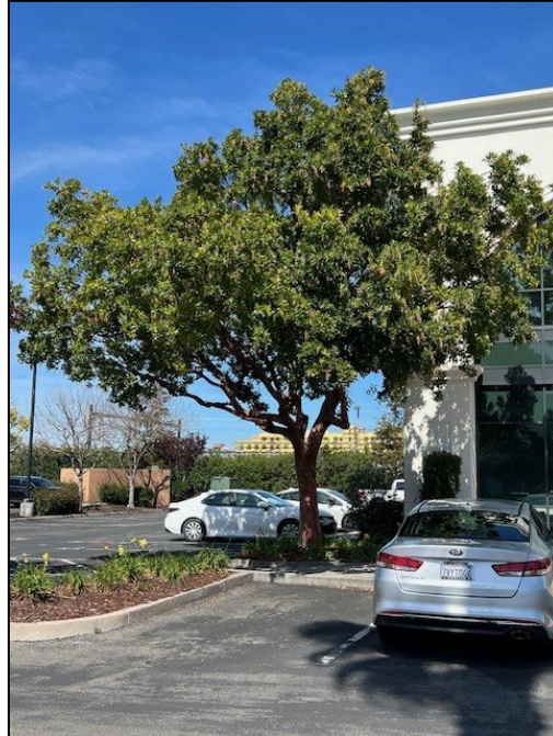
Photo 3. Strawberry tree #120 was in good condition with good structure and form and a full crown.

Twelve (12) Canary Island date palms were growing throughout the site. Eight palms were in fair condition with variable frond color and density. Most had approximately 20 feet of brown trunk and an average diameter of 25 inches. Palms #57, 122 and 135 were in good condition with full crowns and good frond color (Photo 4). Palm #150 was in poor condition with frond dieback and small live fronds.