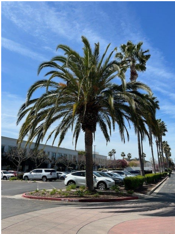
Photo 4. Canary Island date palm #122 was in good condition with a full crown and good frond color.

Twelve (12) Canary Island date palms were growing throughout the site. Eight palms were in fair condition with variable frond color and density. Most had approximately 20 feet of brown trunk and an average diameter of 25 inches. Palms #57, 122 and 135 were in good condition with full crowns and good frond color (Photo 4). Palm #150 was in poor condition with frond dieback and small live fronds.