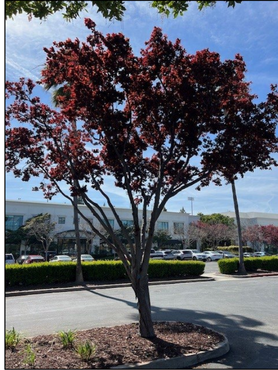
Photo 1. Purpleleaf plum #121 had fair structure and form with multiple attachments at 3 feet.

Forty-five (45) Mexican fan palms were growing either adjacent to buildings or lining the parking lots. Of the 45 palms, 38 were in fair condition with good leaf color and typical fan palm form of a long, slender trunk and pineapple crown (Photo 2). Seven (7) palms were in good condition with green fronds and full crowns. The palms had between 40-50 feet of brown trunk.