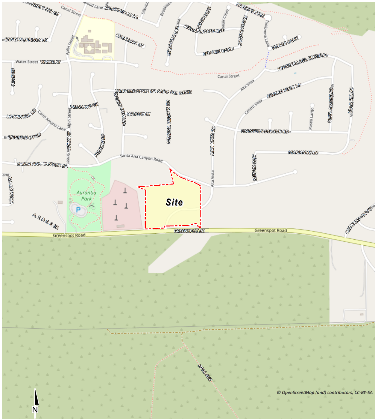
EXHIBIT 1-A: LOCATION MAP