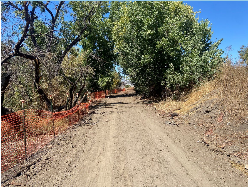
Photograph 10: Overview of the western boundary of the Mabury Road project site; facing south. September 13, 2023