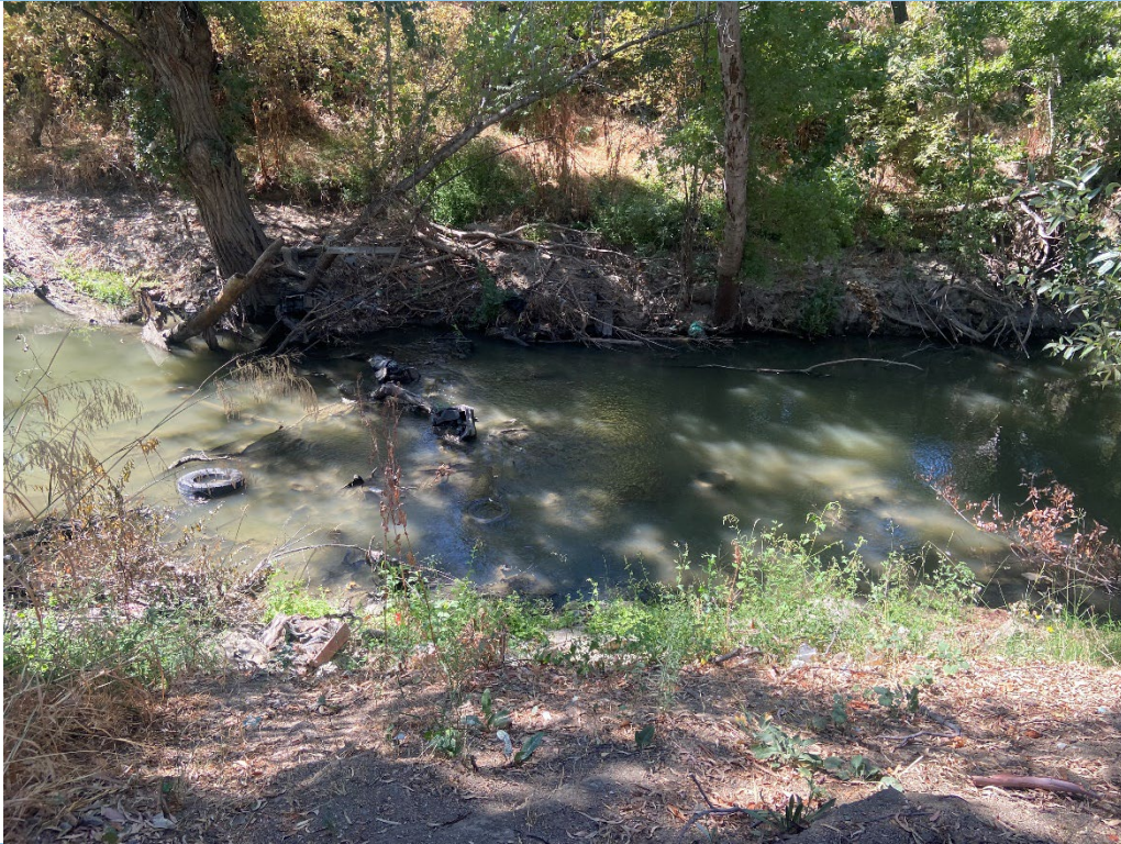
Photograph 11: Overview of Guadalupe Creek from the western boundary of the Mabury Road project site; facing west. September 13, 2023