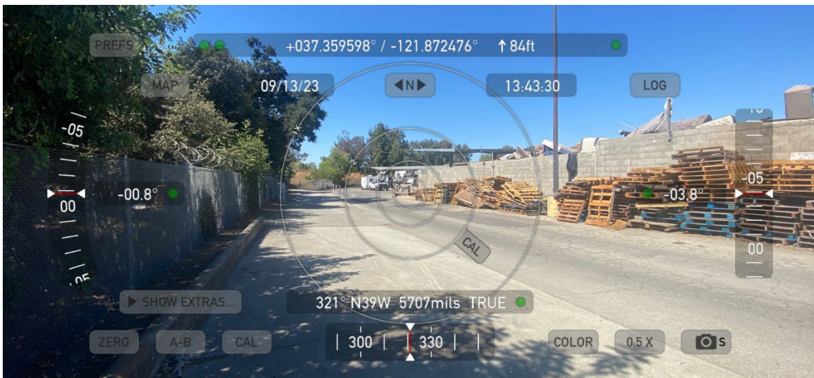
Photograph 8: Overview from the southeast corner of the Mabury Road project site; facing northwest. September 13, 2023