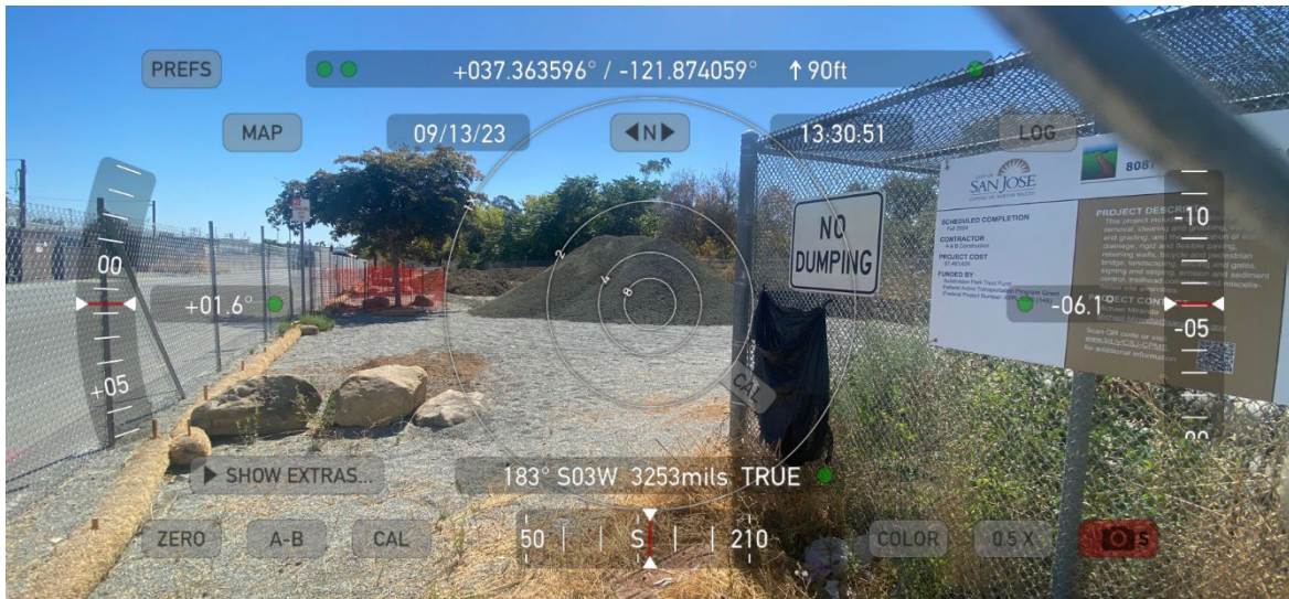
Photograph 6: Overview from the northeast corner of the Mabury Road project site; facing southwest. September 13, 2023