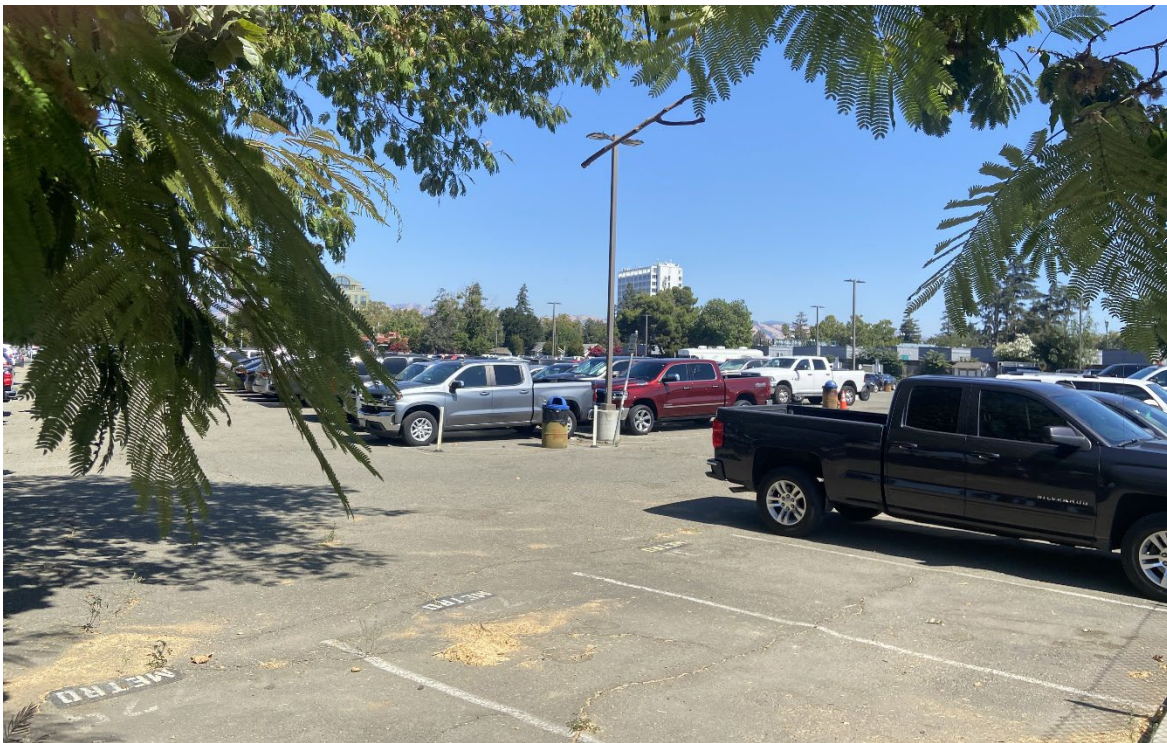
Photograph 4: Overview from the western boundary of the West Mission Street project site; facing east. September 13, 2023