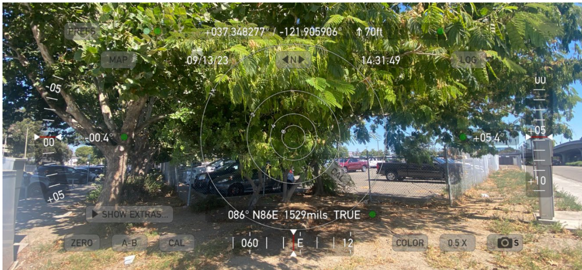
Photograph 2: Overview from the southwest corner of the West Mission Street project site; facing northeast. September 13, 2023