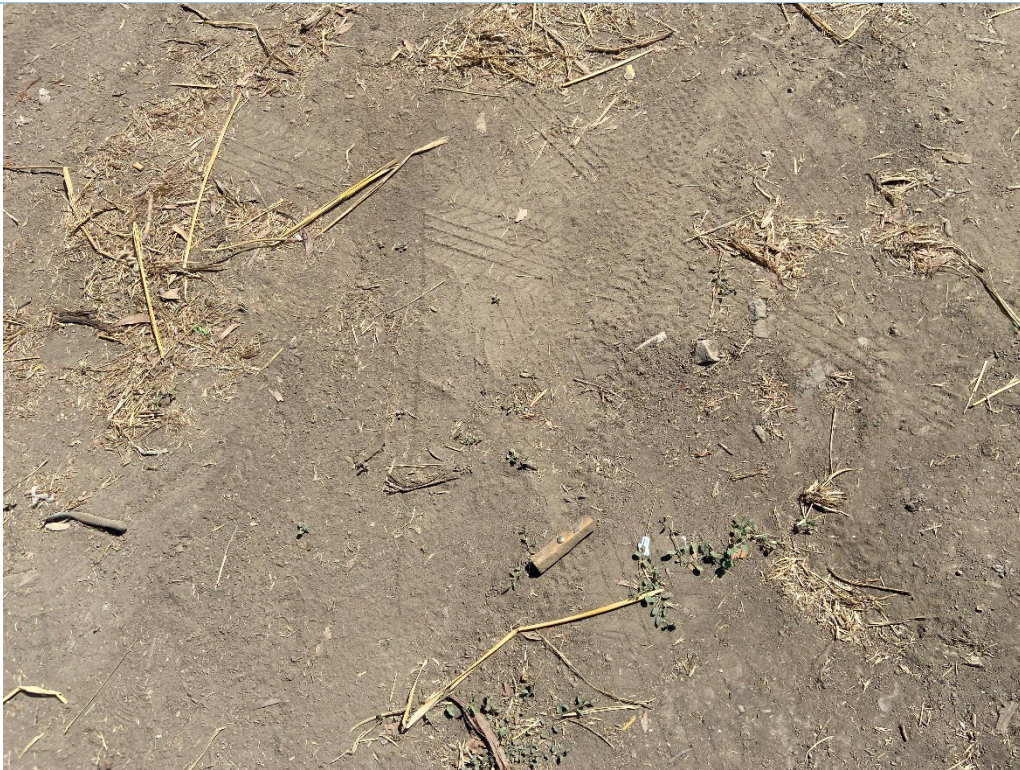
Photograph 12: Representative photo of soil composition from the western boundary of the Mabury Road project site. September 13, 2023