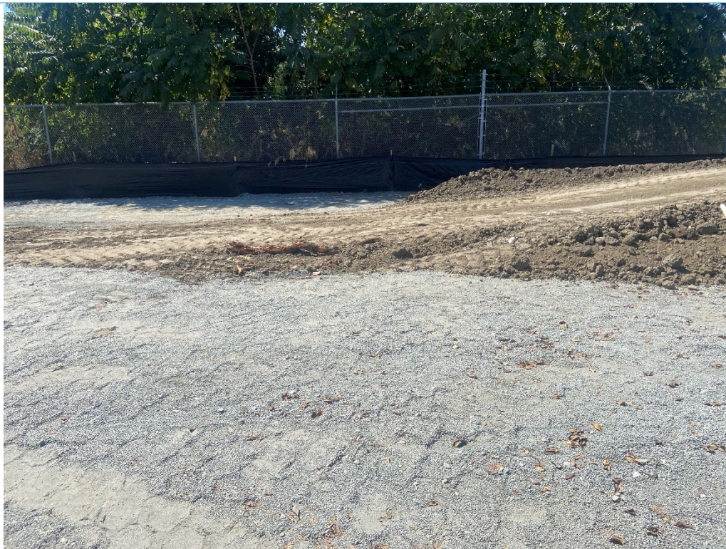
Photograph 14: Representative photo of the soil in the northern portion of the Mabury Road project site; facing west. September 13, 2023