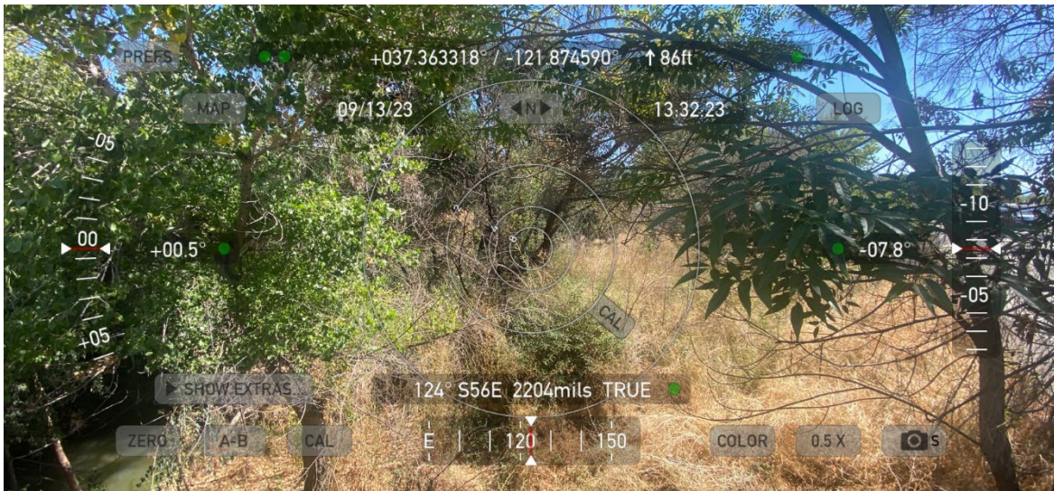
Photograph 7: Overview from the northwest corner of the Mabury Road project site; facing southeast. September 13, 2023