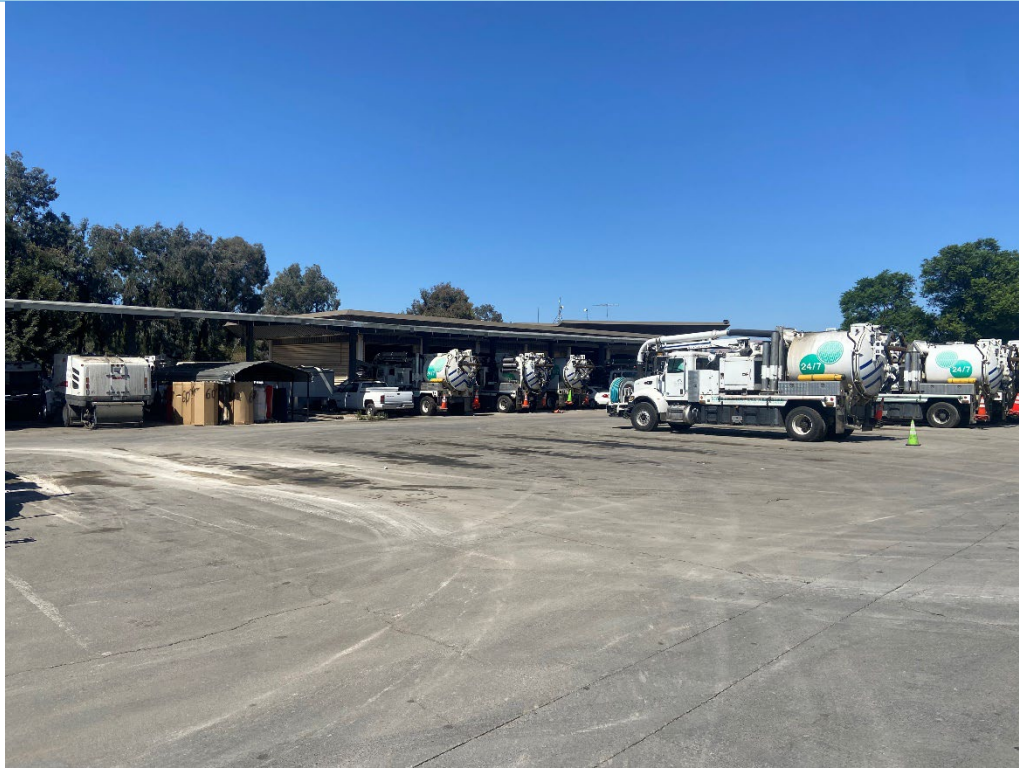
Photograph 13: Representative photo of the hardscaped nature of the majority of the Mabury Road project site. Photo taken in the southeast corner of the project site; facing northwest. September 13, 2023