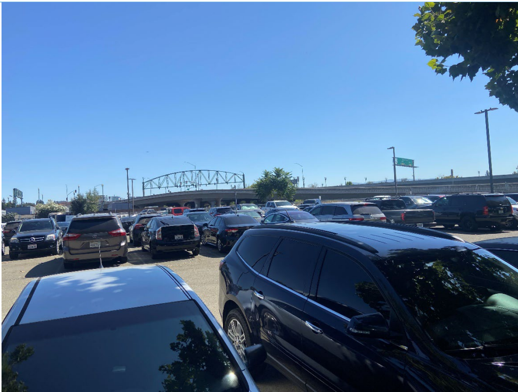
Photograph 3: Overview from the northern boundary of the West Mission Street project site; facing southeast. September 13, 2023