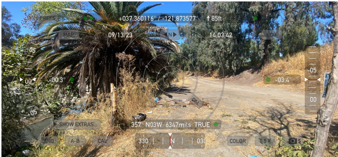
Photograph 9: Overview from the southwest corner of the Mabury Road project site; facing north. September 13, 2023