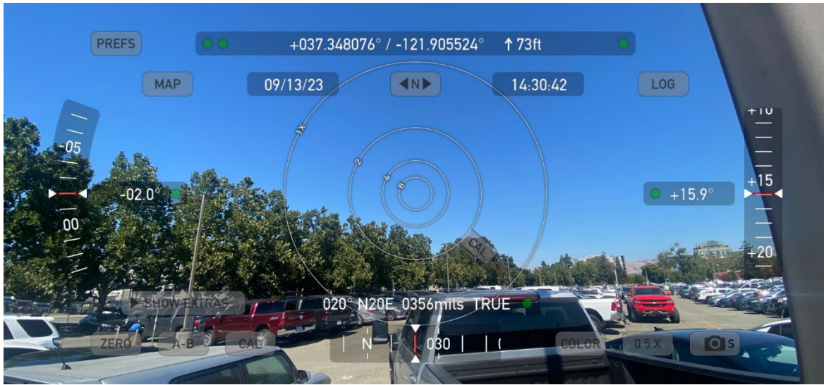
Photograph 1: Overview from the southeast corner of the West Mission Street project site; facing northwest. September 13, 2023