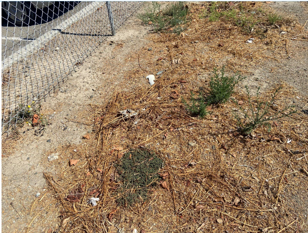
Photograph 5: Representative soil composition of imported gravel in the eastern boundary of the West Mission Street project site. September 13, 2023