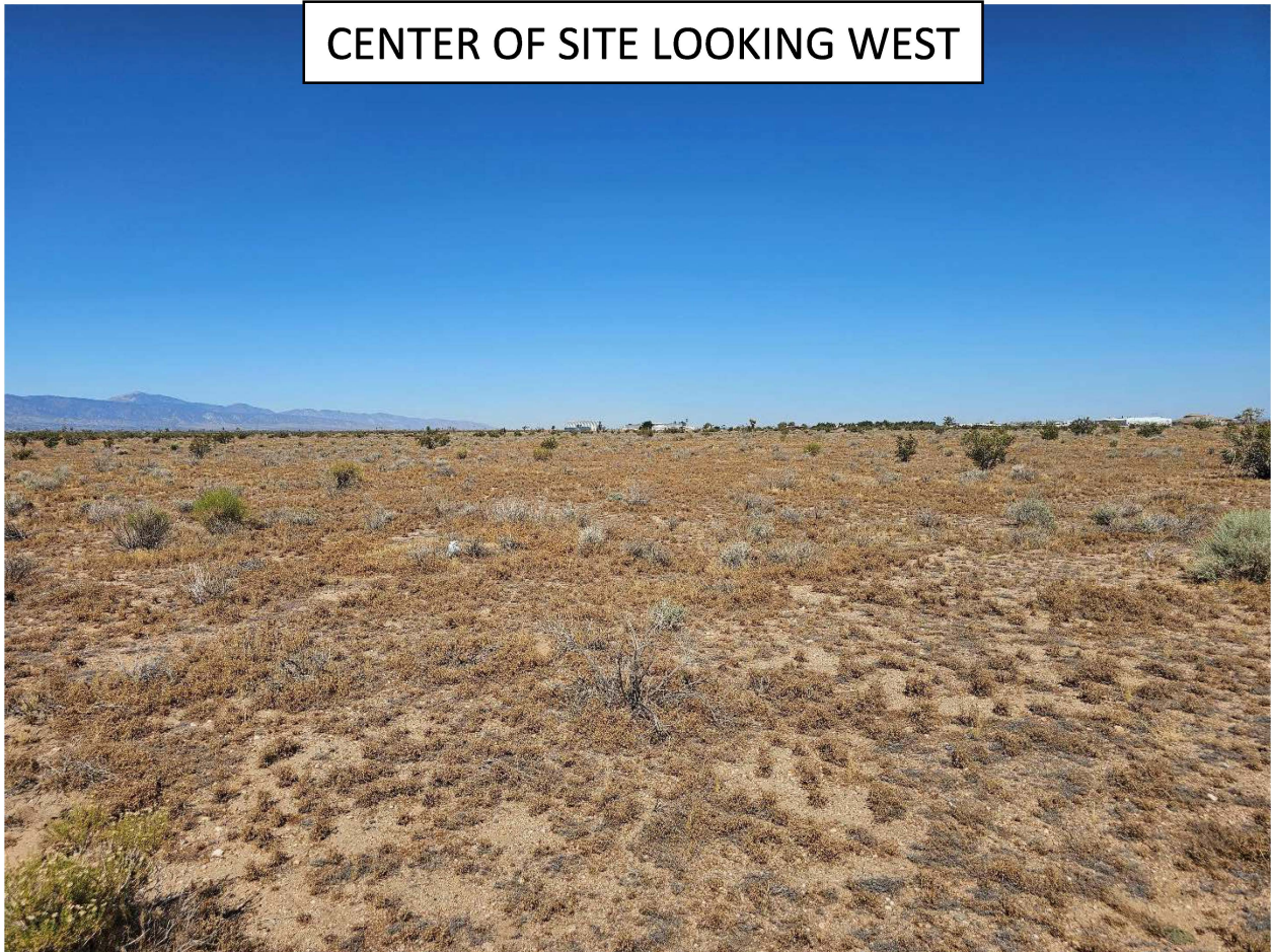
FIGURE 3, cont: PHOTOGRAPHS OF SITE