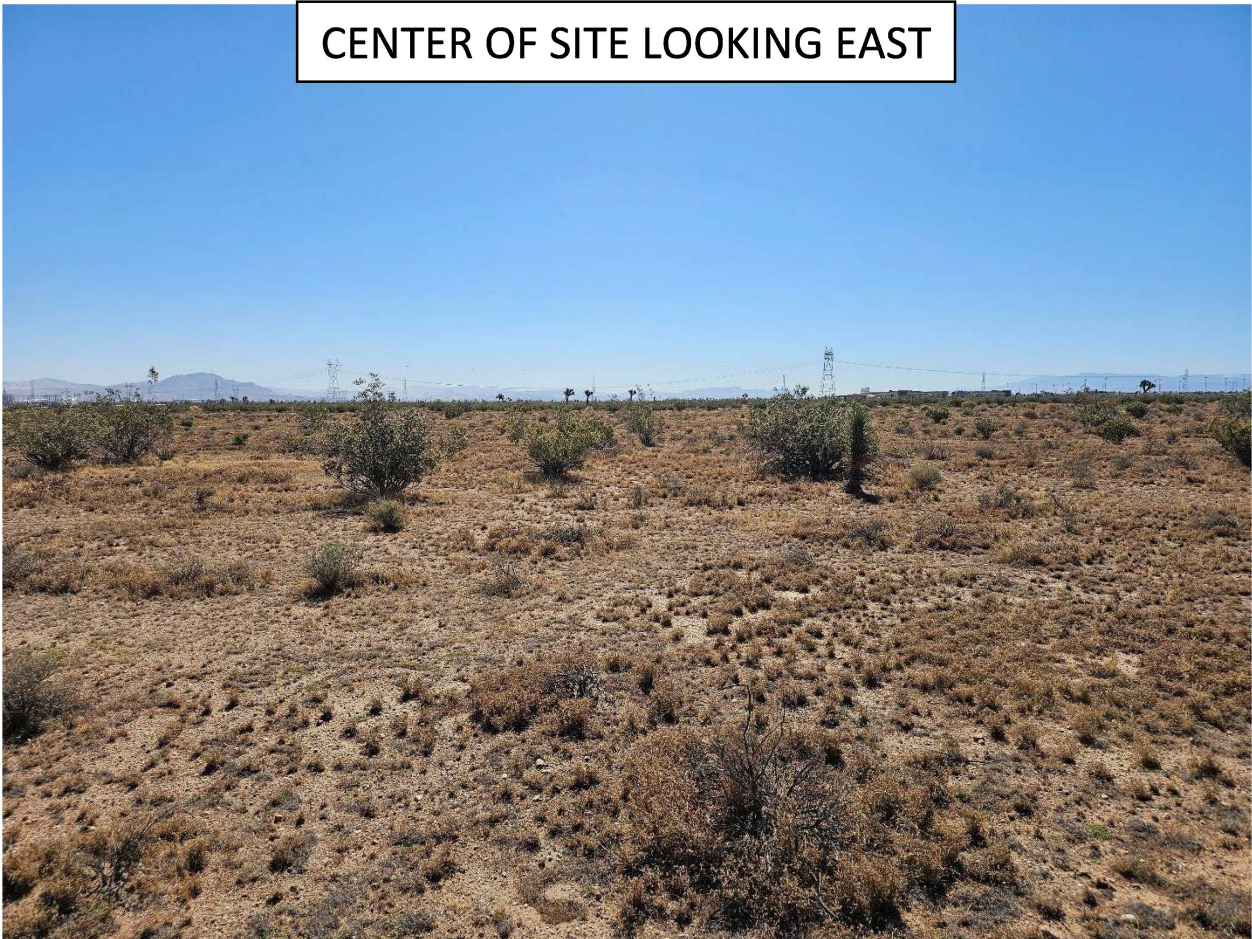
FIGURE 3: PHOTOGRAPHS OF SITE