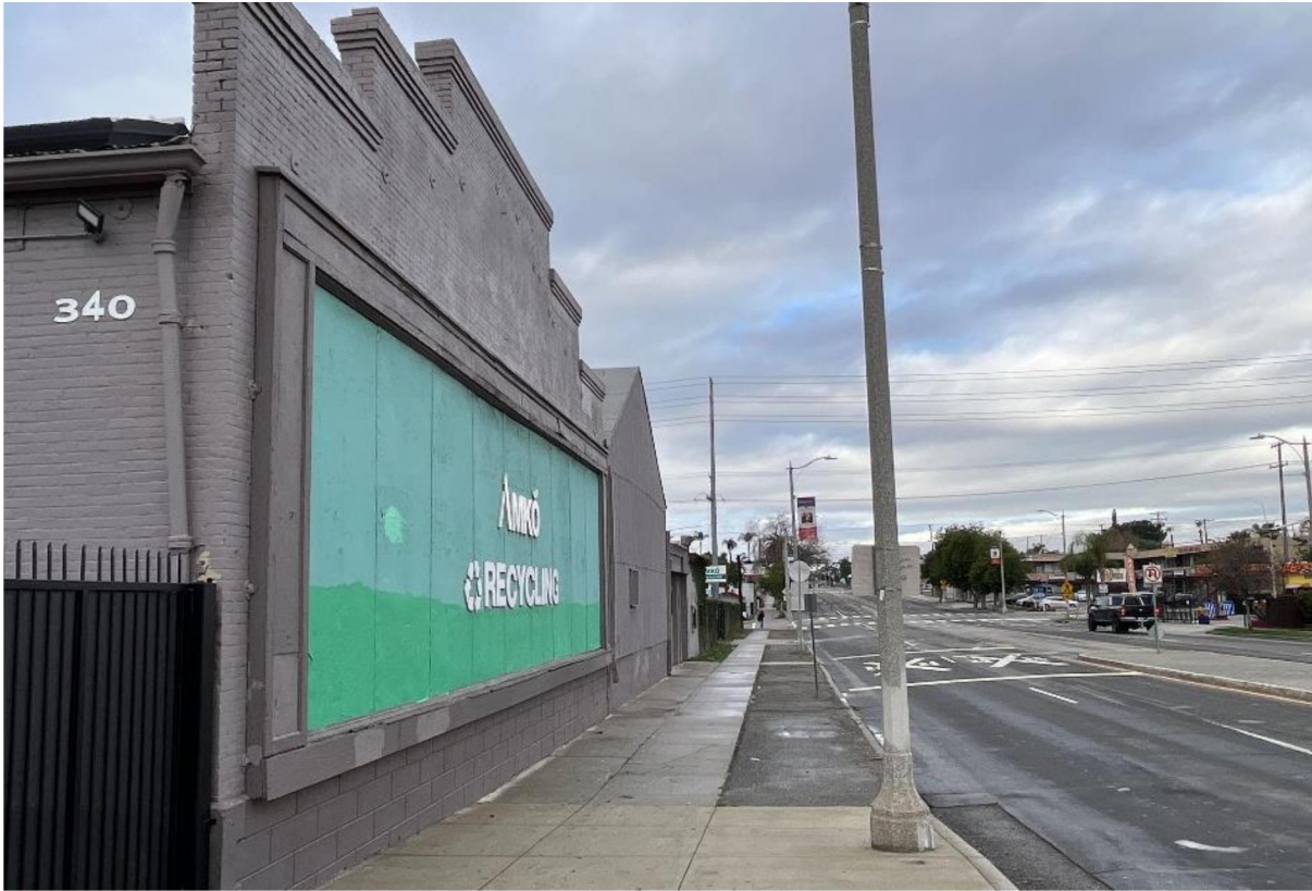
Photograph 11. Facing west towards AMKO Warehouse from West Valley Boulevard.