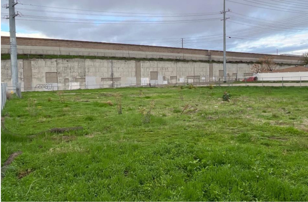
Photograph 3. Overview of project site facing southwest towards West J Street.