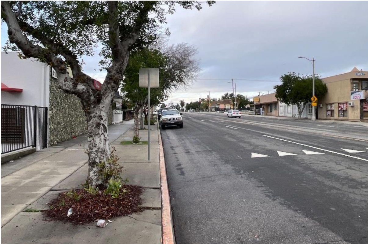
Photograph 9. Facing west from North Pennsylvania Avenue and West Valley Boulevard.