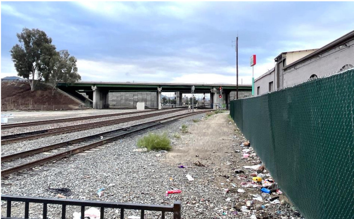
Photograph 8. Facing Interstate 10 and AMKO Warehouse from West Valley Boulevard.