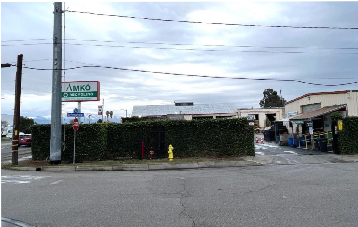
Photograph 2. AMKO Warehouse Facility, existing entrance.