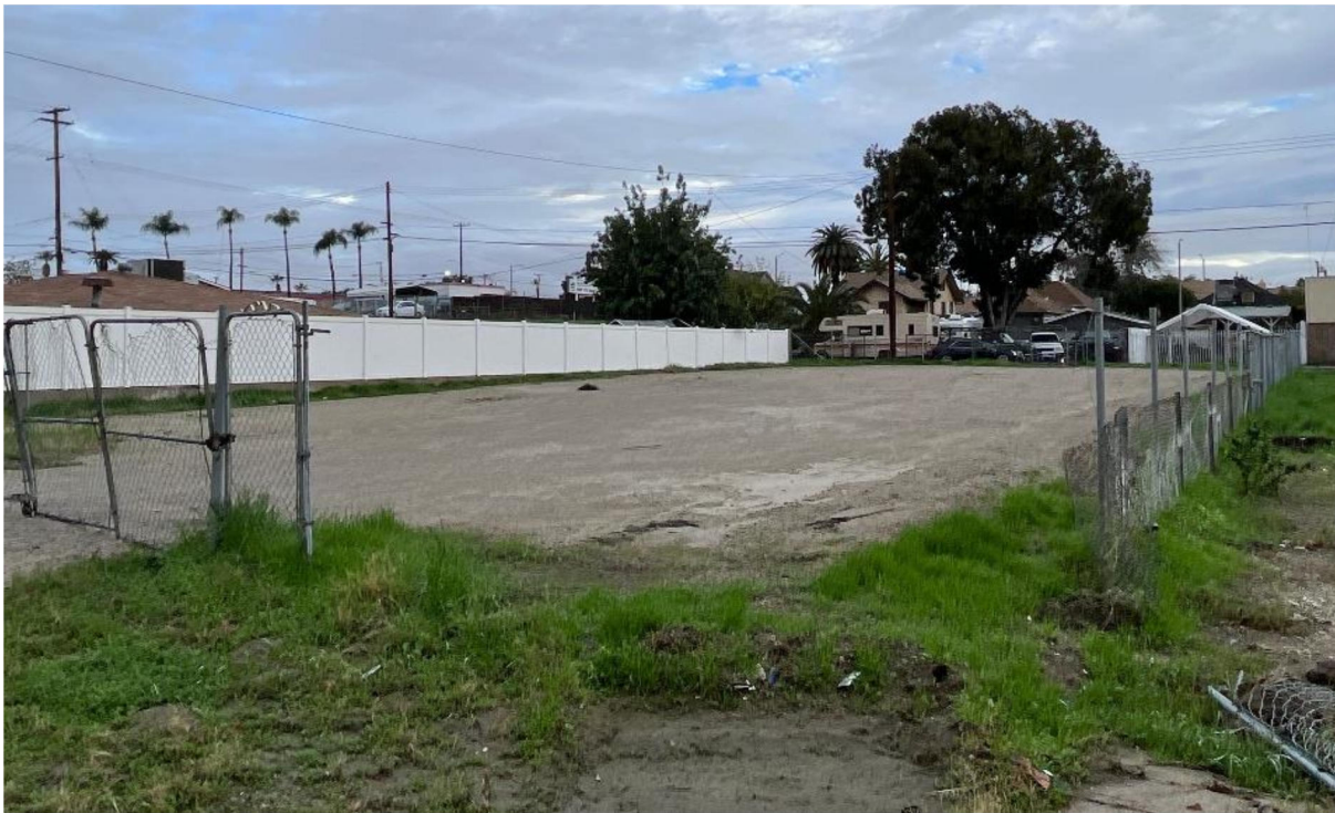
Photograph 4. Project site facing north from West J Street.