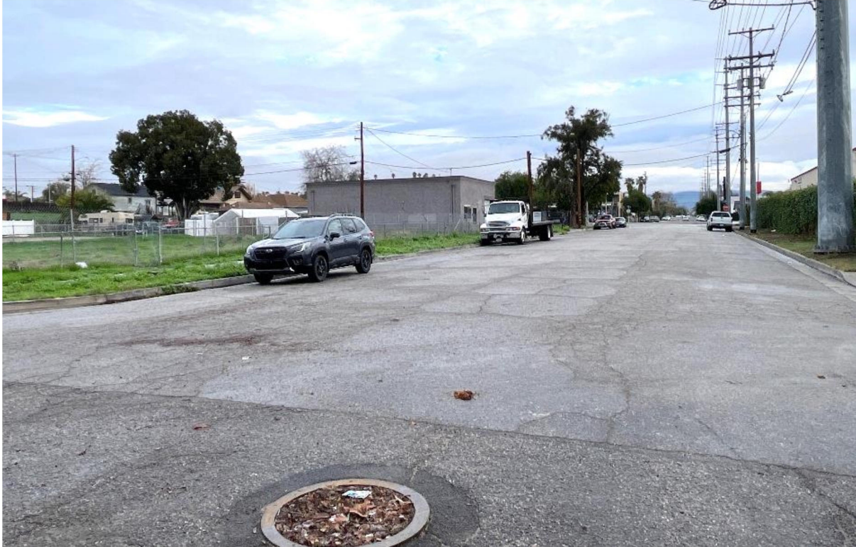
Photograph 7. Facing north on North Pennsylvania Ave and West J Street, adjacent to project site.