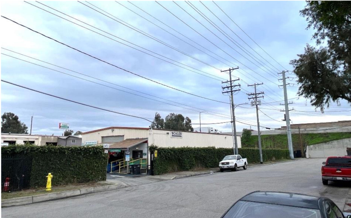
Photograph 1. AMKO Warehouse facing southeast from West Valley Boulevard.