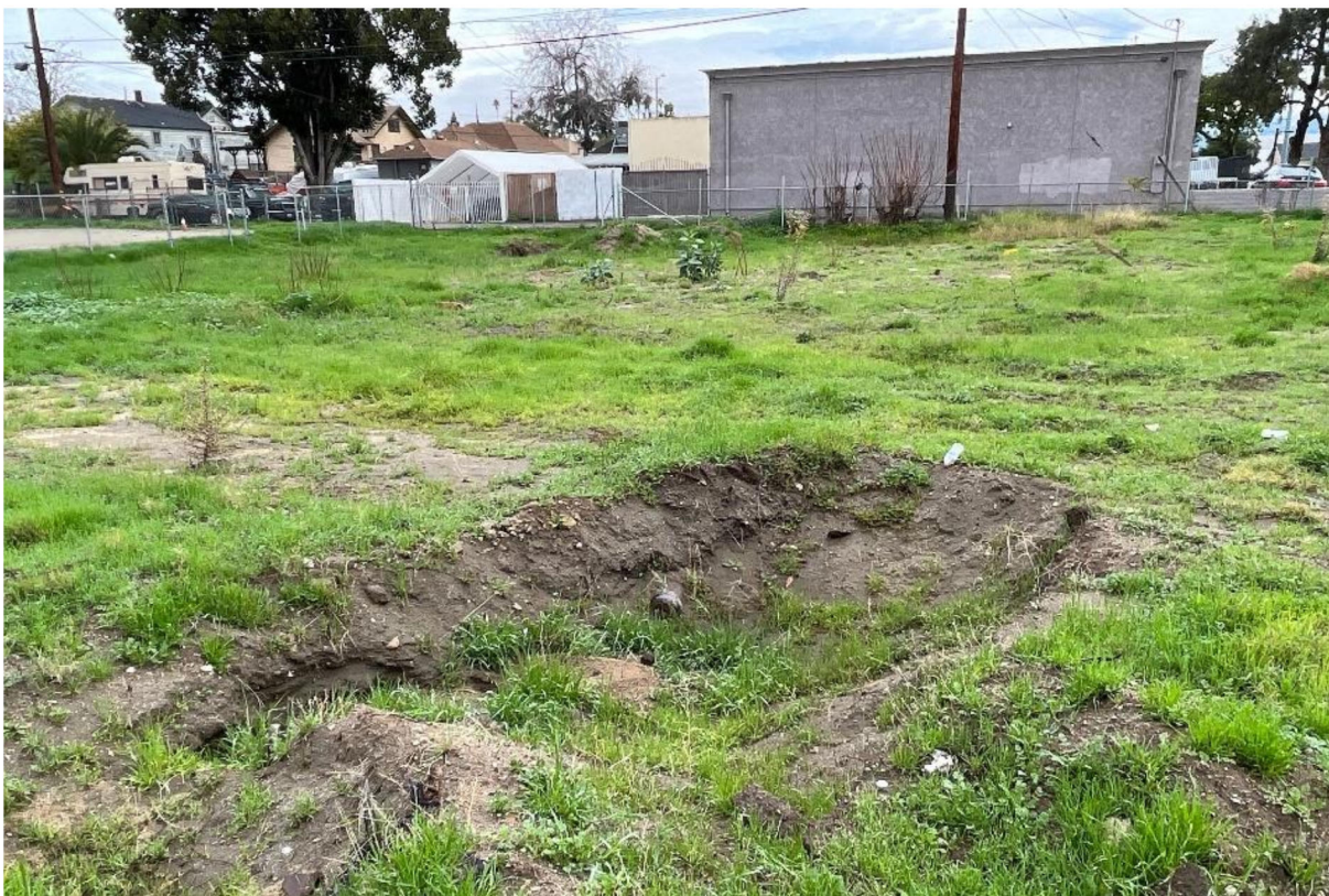
Photograph 14. Facing north on project site toward additional project property.