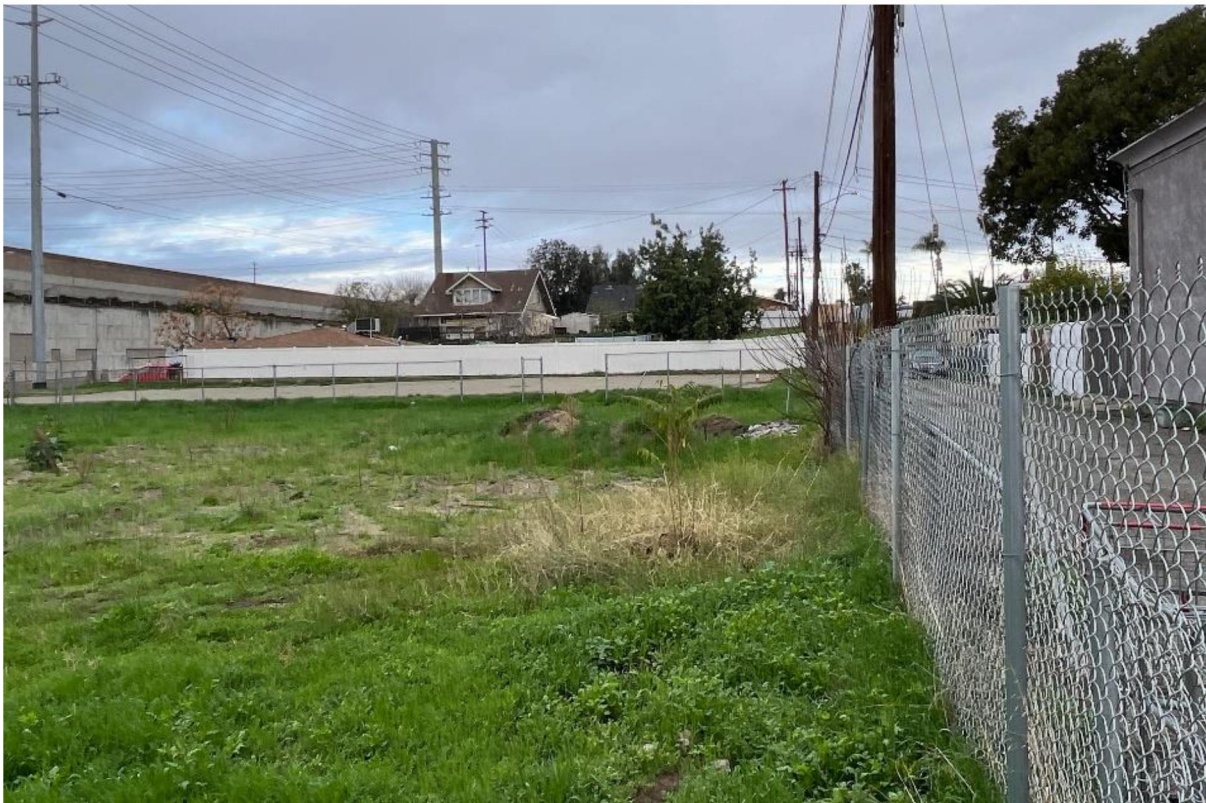
Photograph 12. Facing west towards project site from North Pennsylvania Avenue.