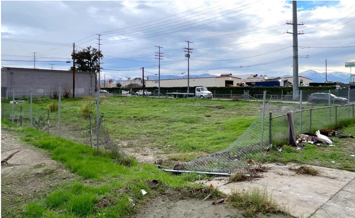
Photograph 13. Facing northwest from corner of West J Street and North Pennsylvania Avenue.