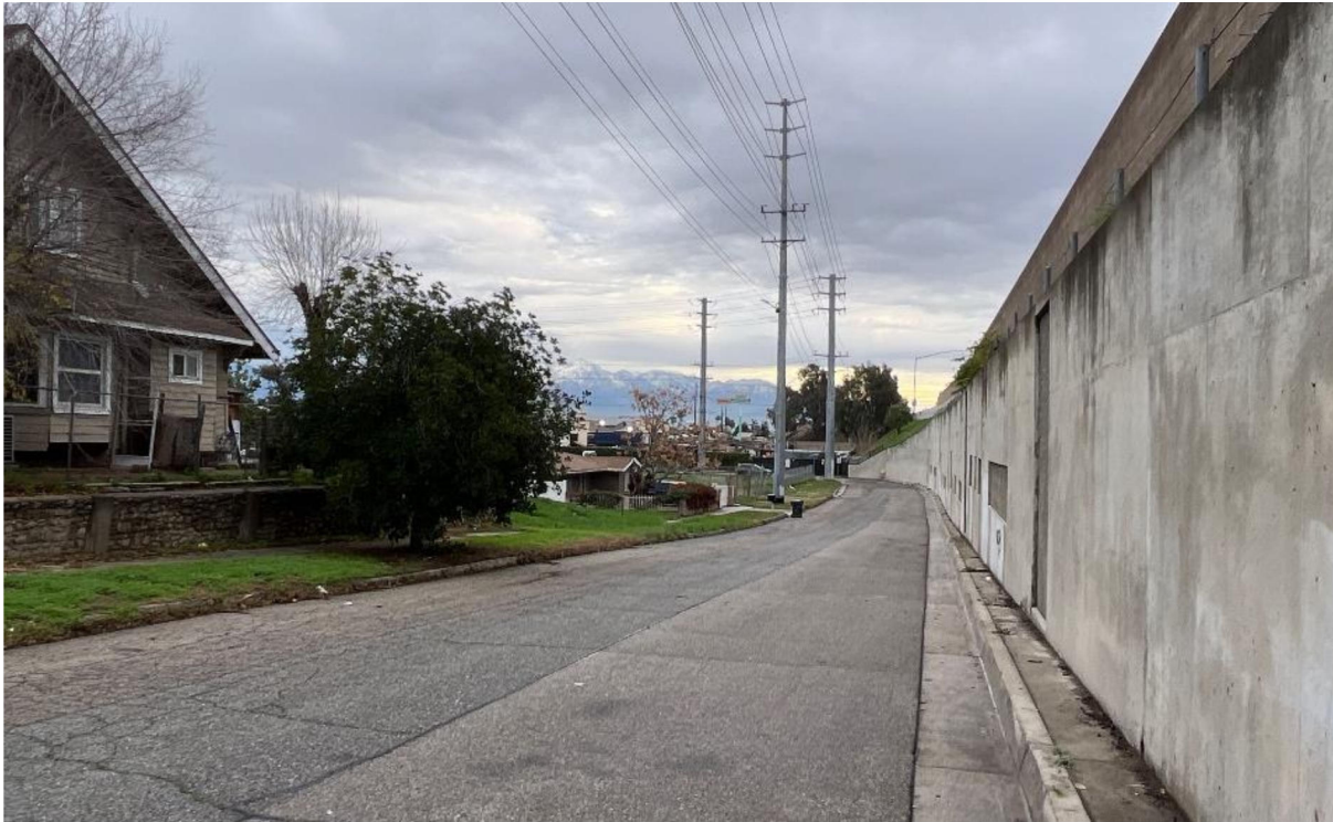
Photograph 5. Facing east, view from West J Street at survey limit.