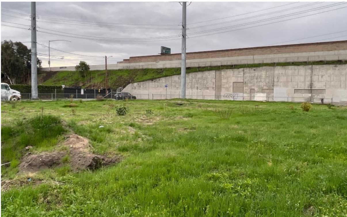
Photograph 16. View of project site facing south toward southern end of AMKO Warehouse.