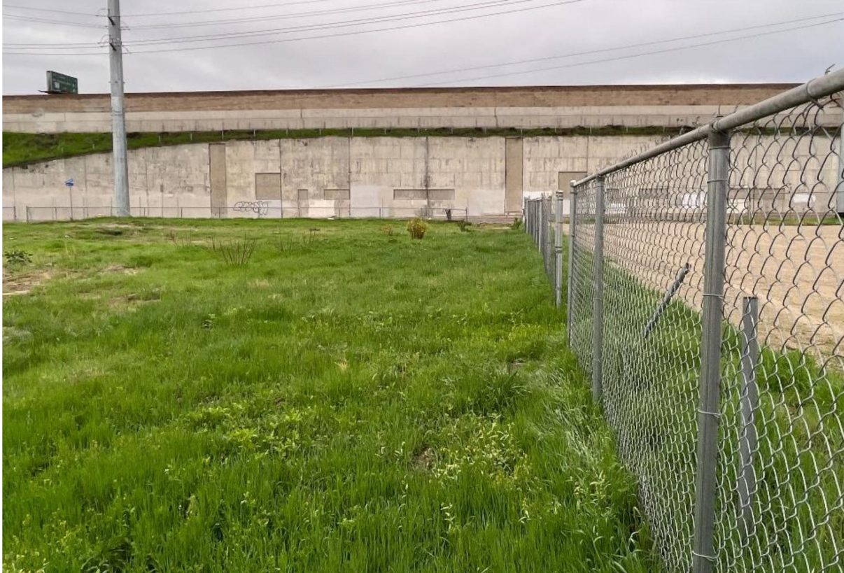
Photograph 15. View of project site facing south toward Interstate 10.