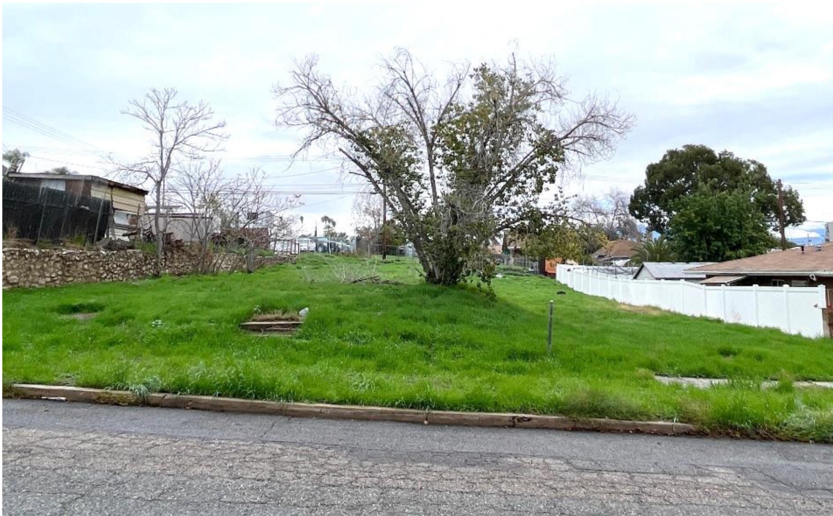
Photograph 6. Facing north, property adjacent to project site from West J Street.