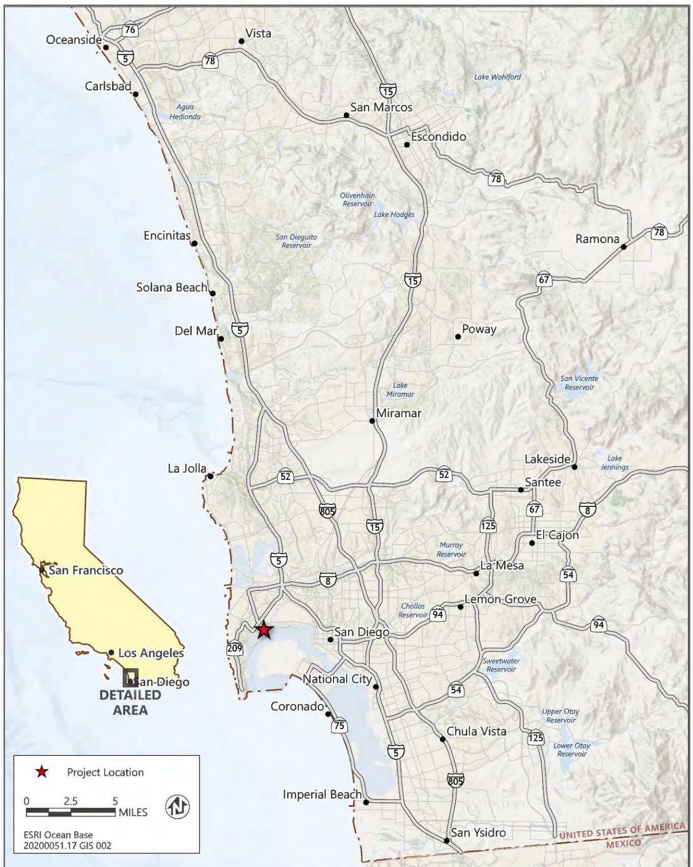
Figure 1 Project Vicinity