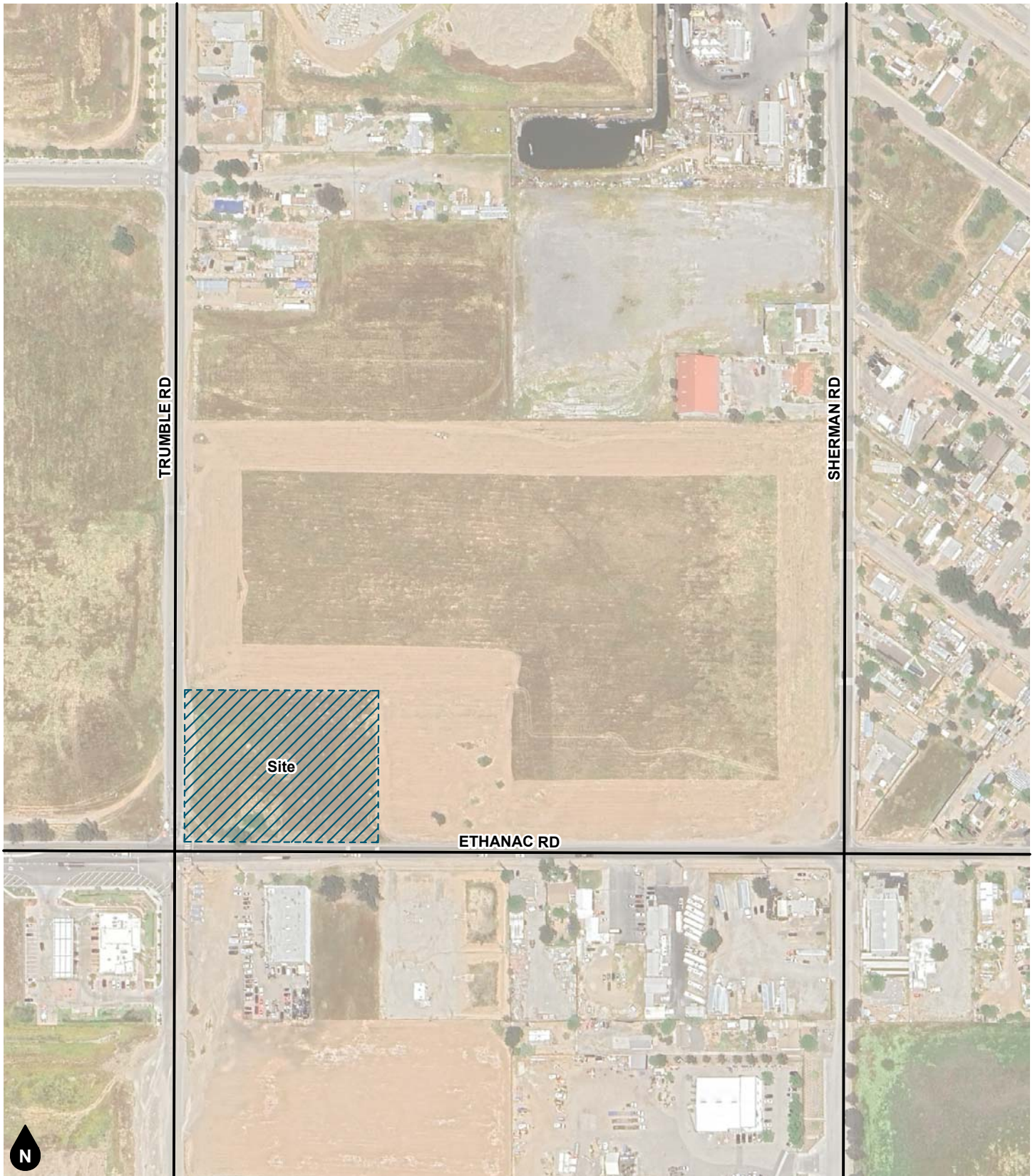
Figure 1 Project Location Map