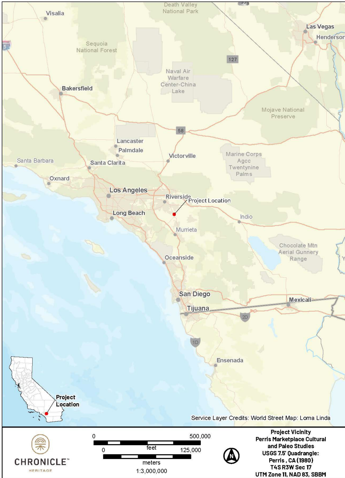
Figure 1. Project vicinity map.