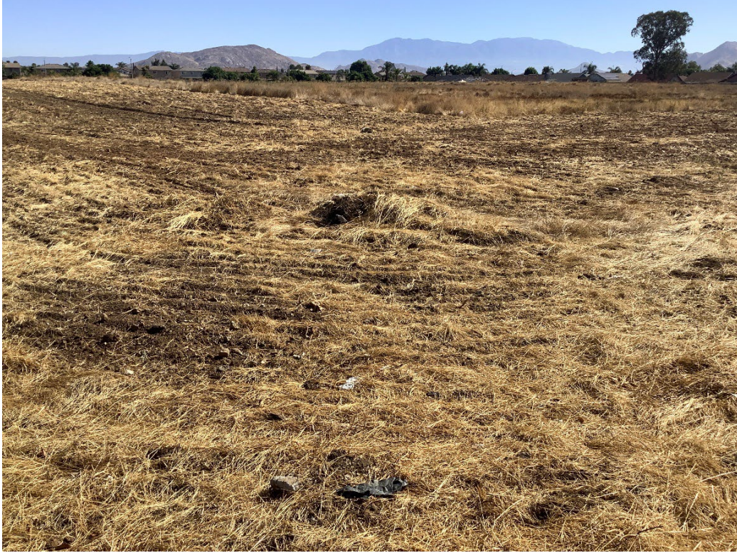
Figure 4. View of Project area from southwestern corner to the northeast showing signs of recent ground disturbance and human trash.