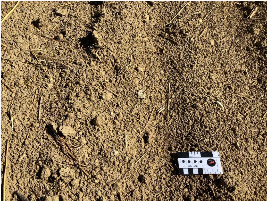
Figure 5. Exposed natural ground surface along eastern edge.