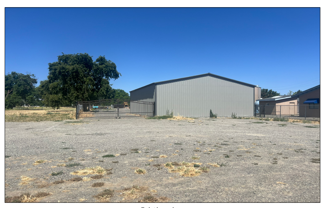
Existing view looking west at existing building