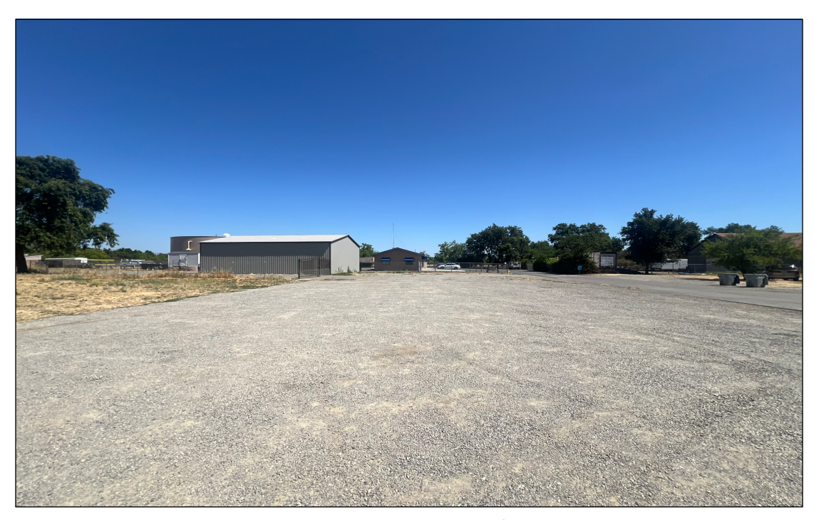
Existing view looking north from State Route 16