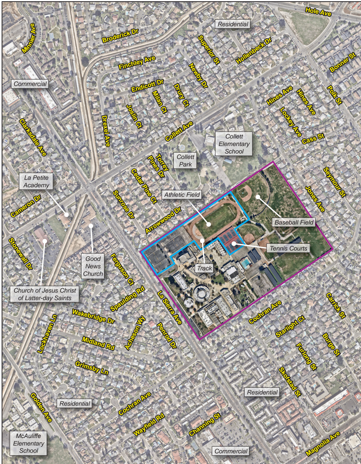
Figure 1 - Aerial Photograph

— La Sierra High School Boundary — Project Site Boundary