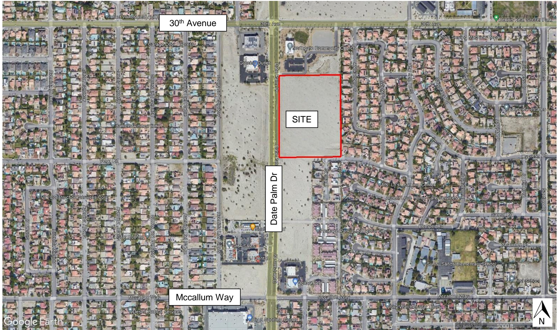
Exhibit A Location Map