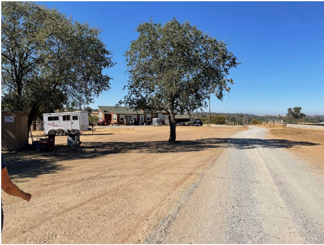
Figure 7- view looking south at the parking area with trailer