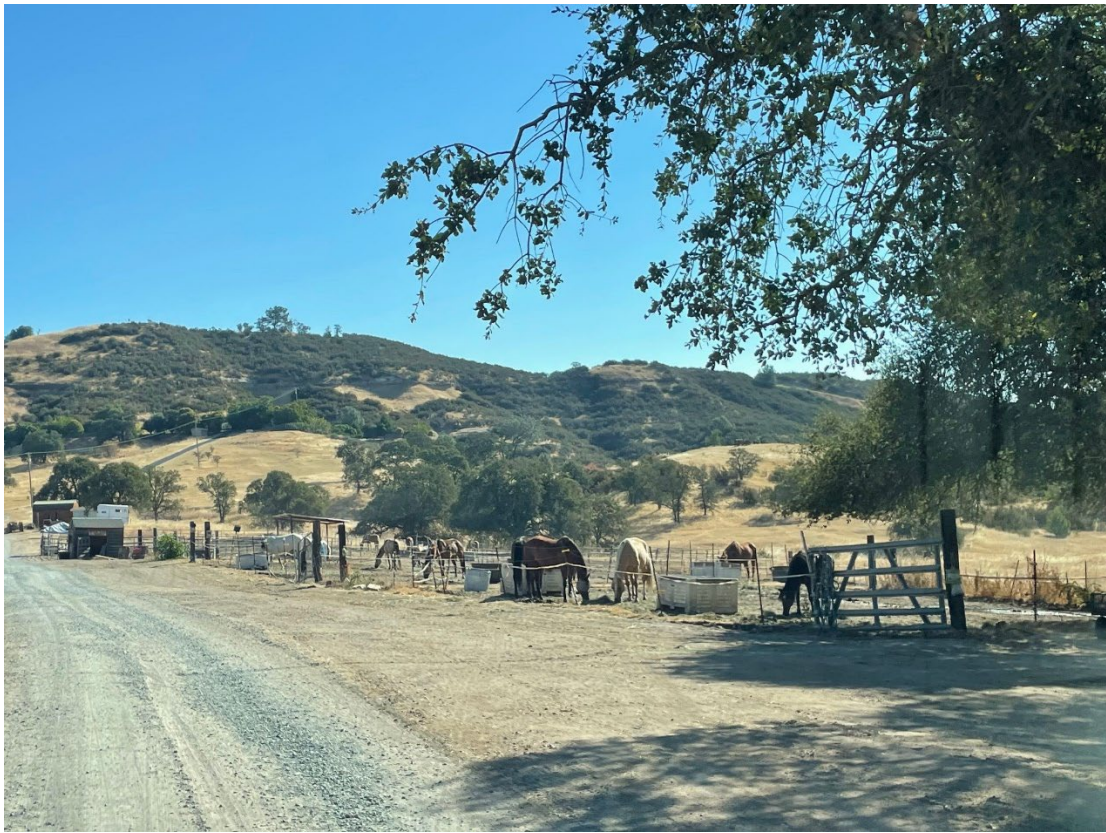
Figure 5- View looking northeast at horse paddocks