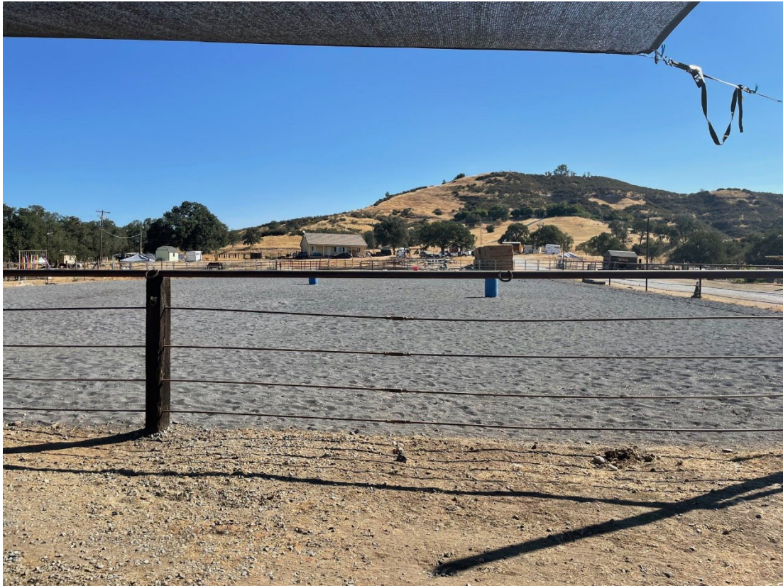
Figure 4- View of arena looking north toward the residence