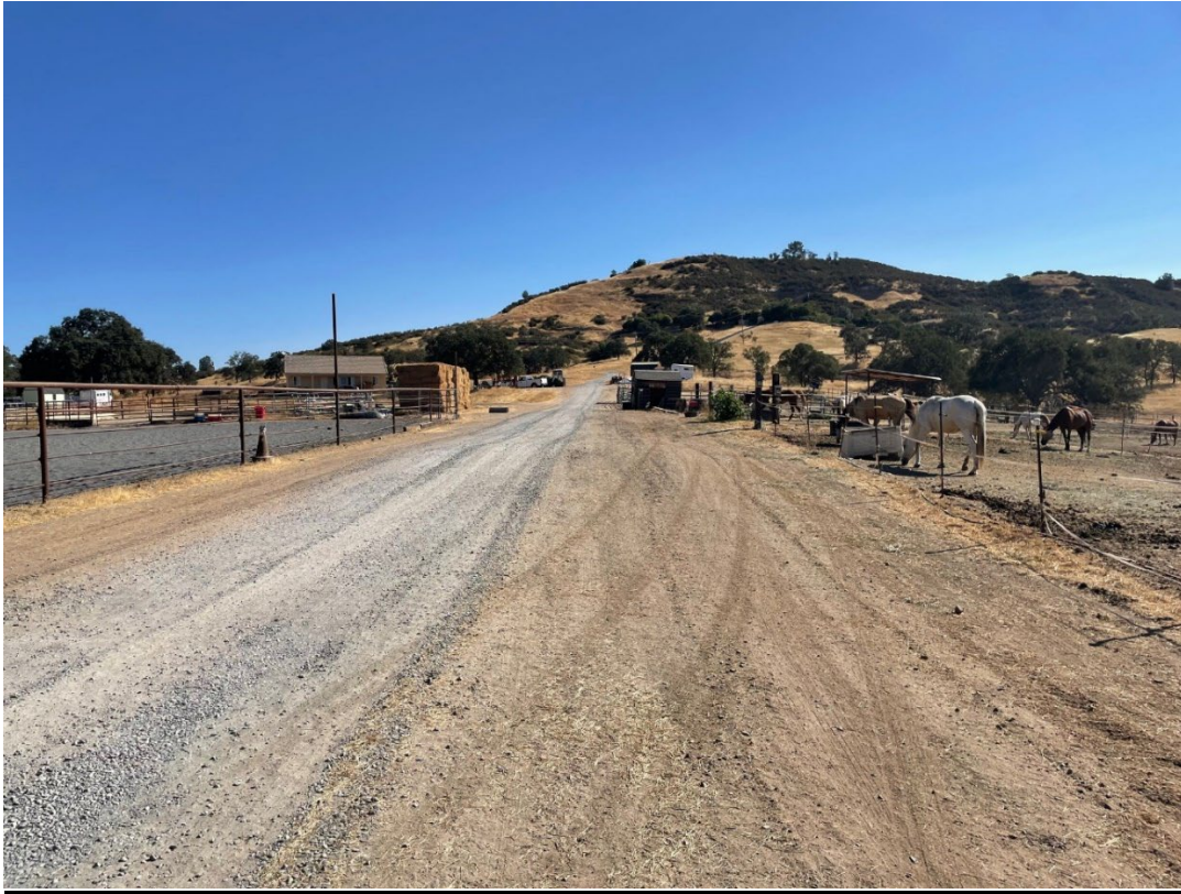
Figure 6- View looking north along easement