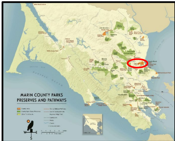
McInnis Park Regional Location