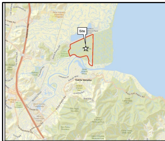
McInnis Park Location