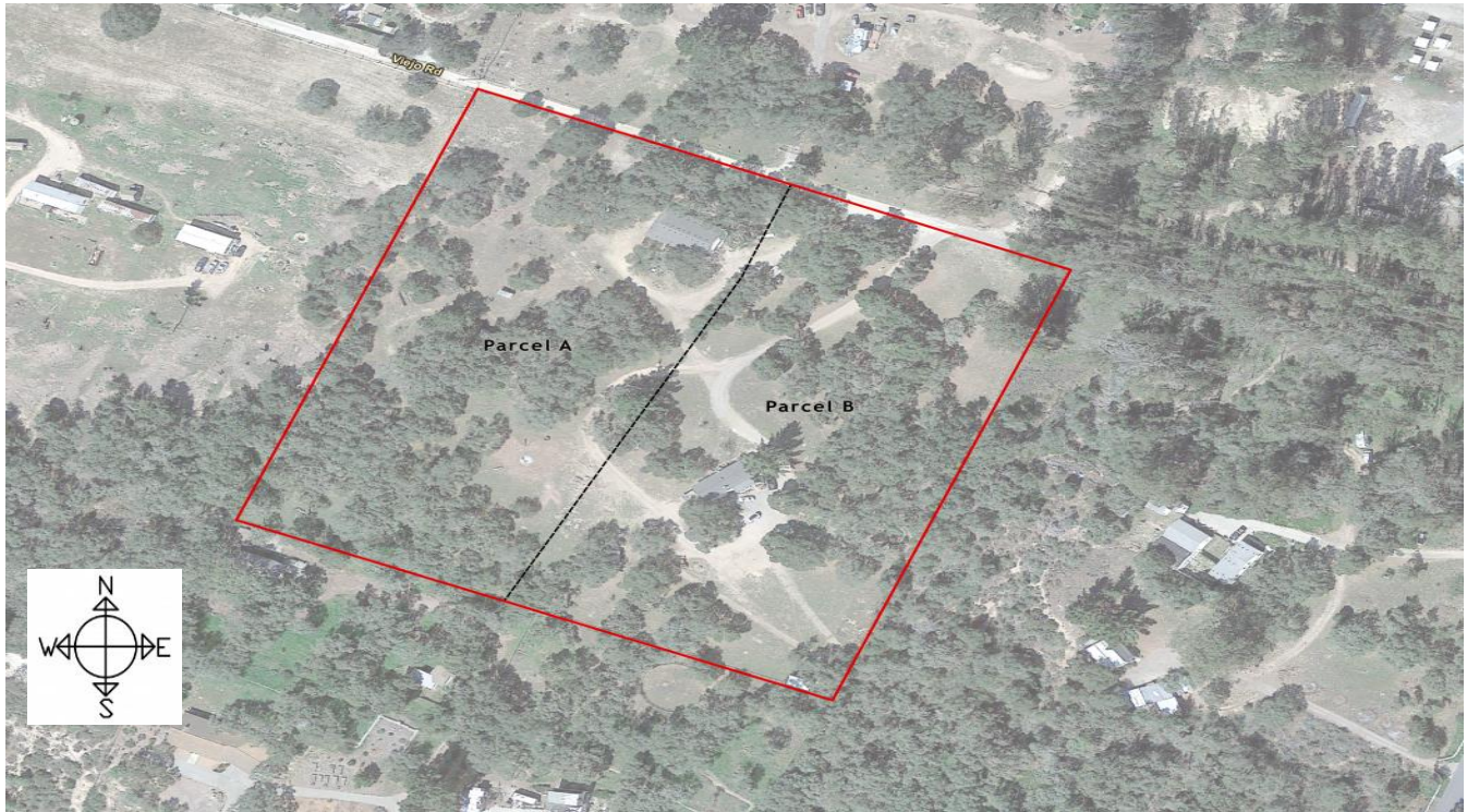
Figure 3 – Aerial View of the Proposed Subdivision