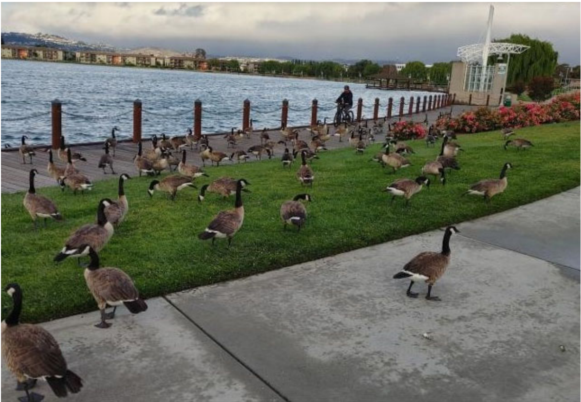
City of Foster City, California