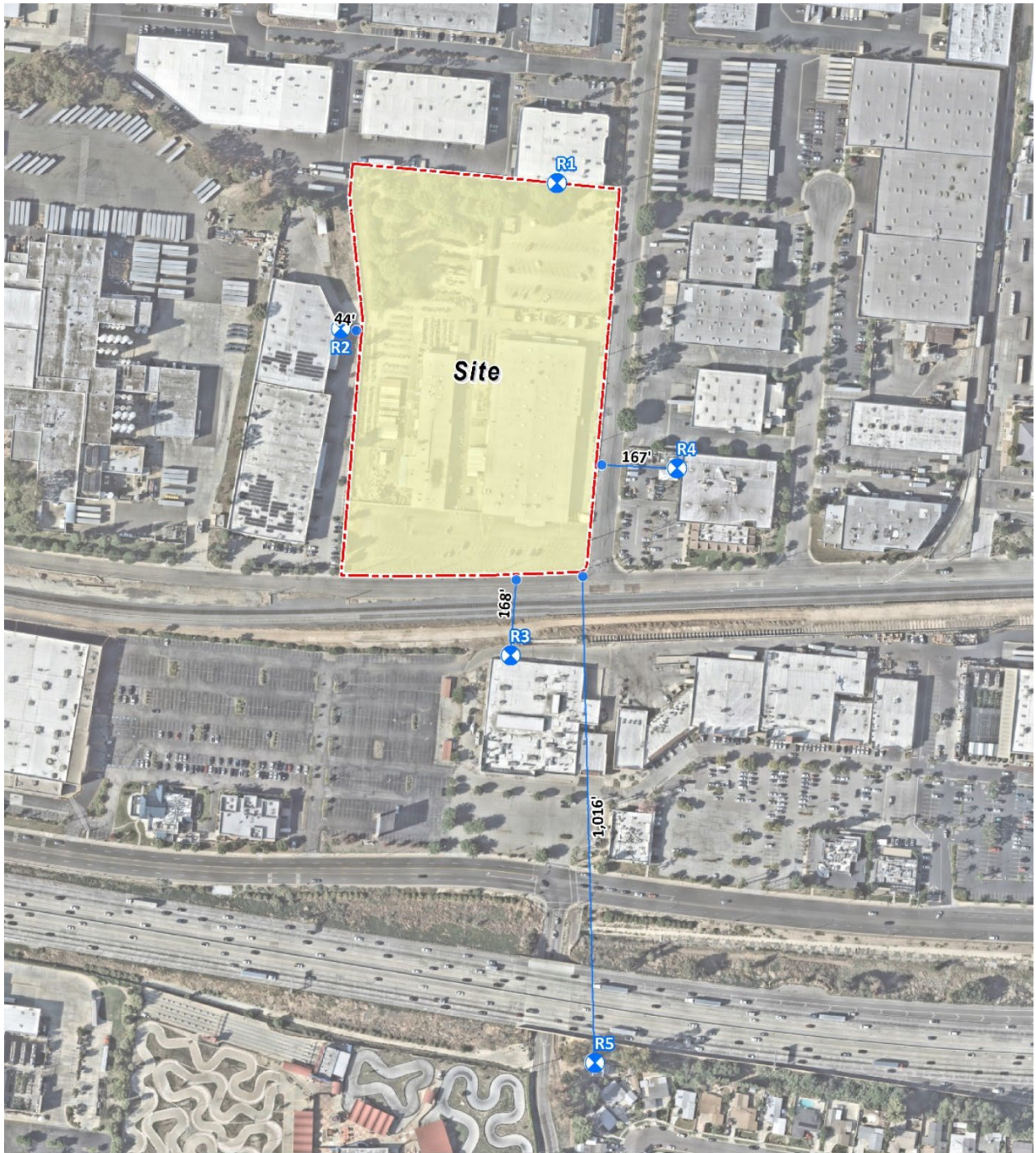
EXHIBIT 2: SENSITIVE RECEPTOR LOCATIONS