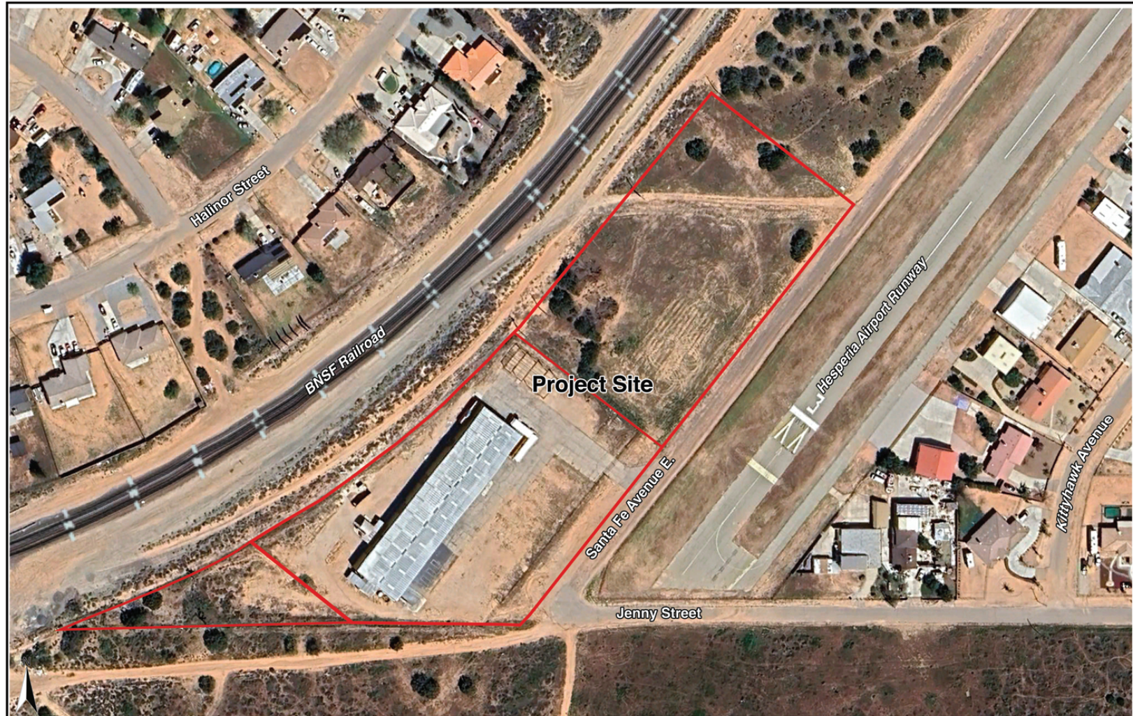
Figure 2 - Aerial View