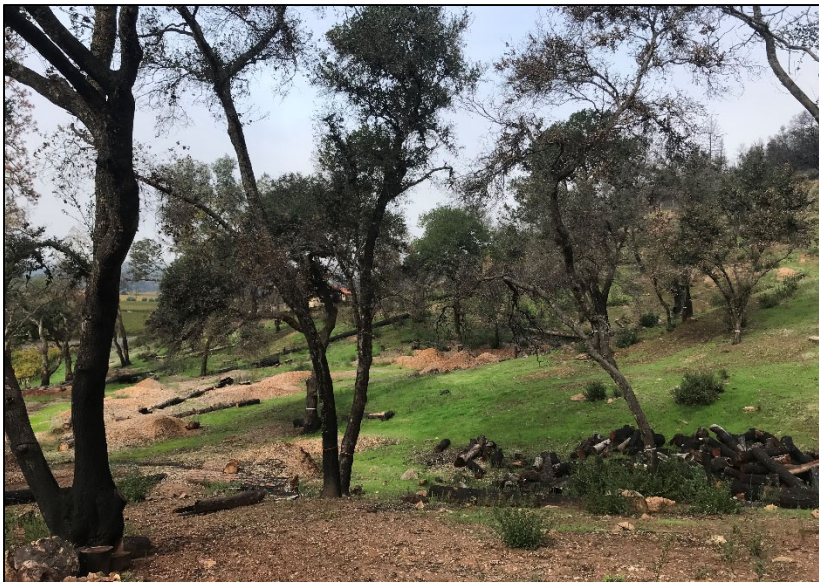
Overview of Study Area; approved clearing after the Glass Fire of Fall 2020