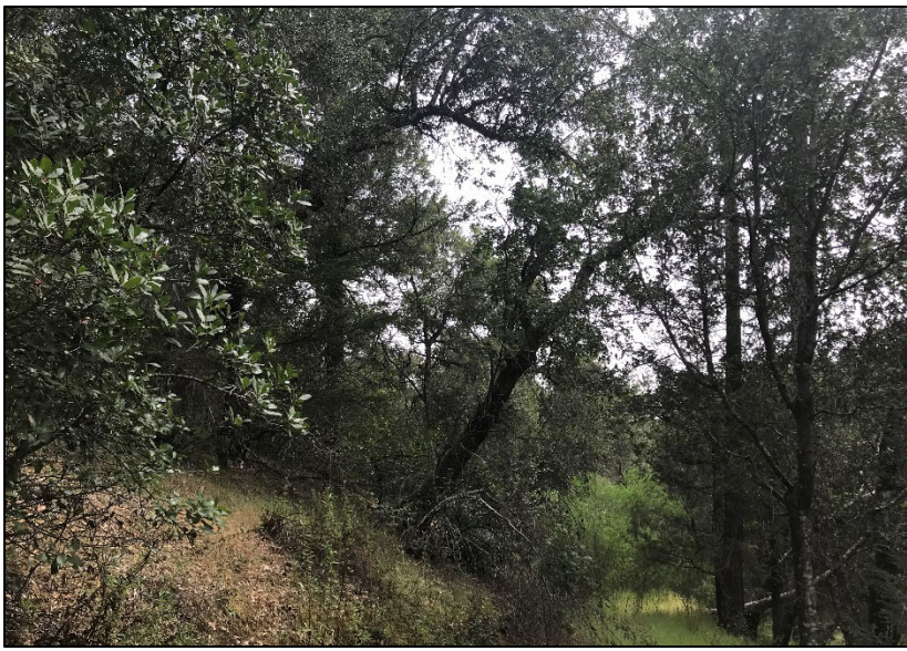
Coast live oak woodland in the Study Area prior to the Glass Fire of Fall 2020