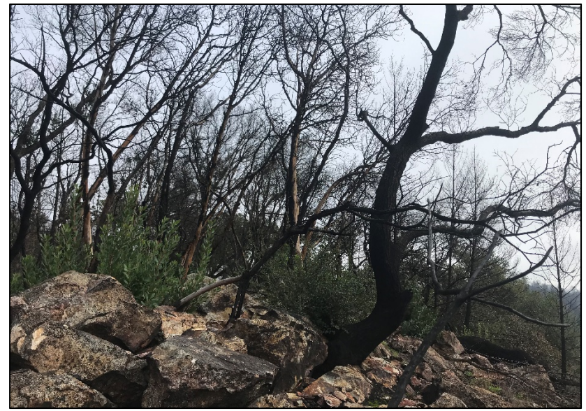
Coast live oak woodland in the Study Area after the Glass Fire of Fall 2020