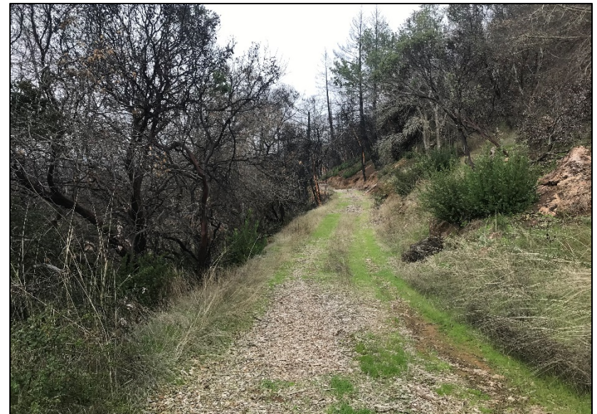
Existing dirt fire road on eastern boundary of the Study Area