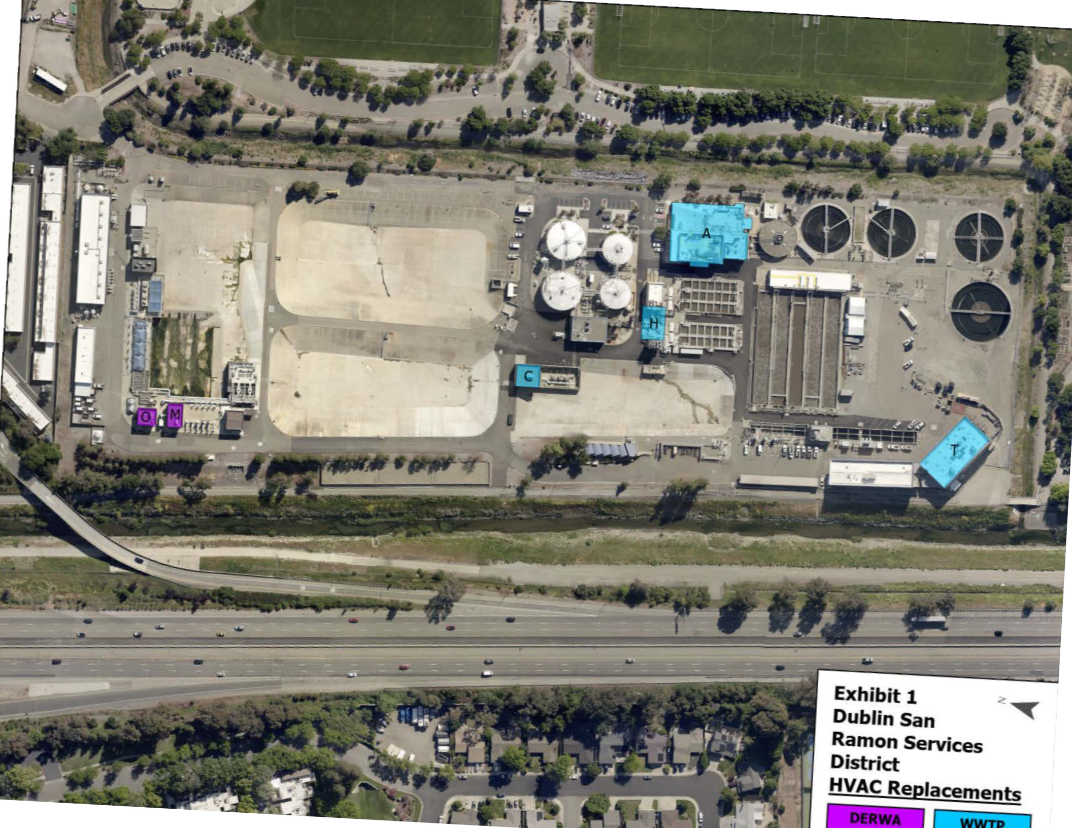
Exhibit 1 Dublin San Ramon Services District HVAC Replacements