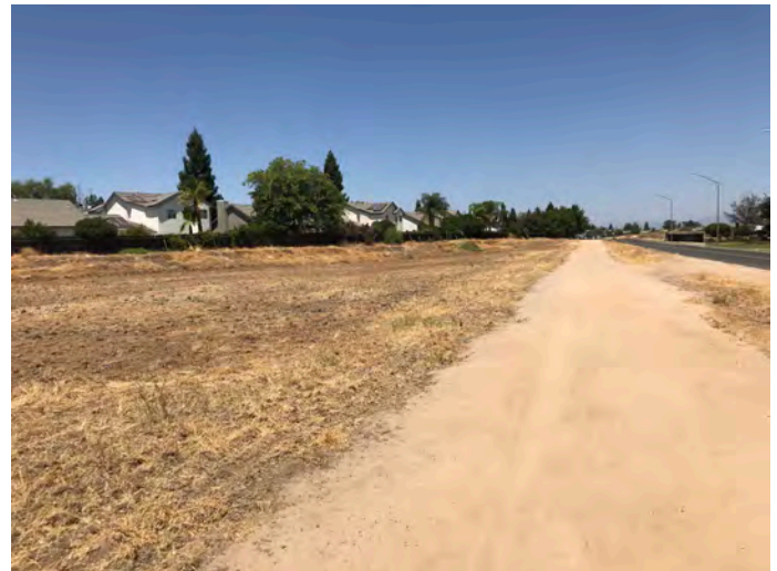
Overview of the property facing north showing bare ground and ruderal habitat. August 4, 2020