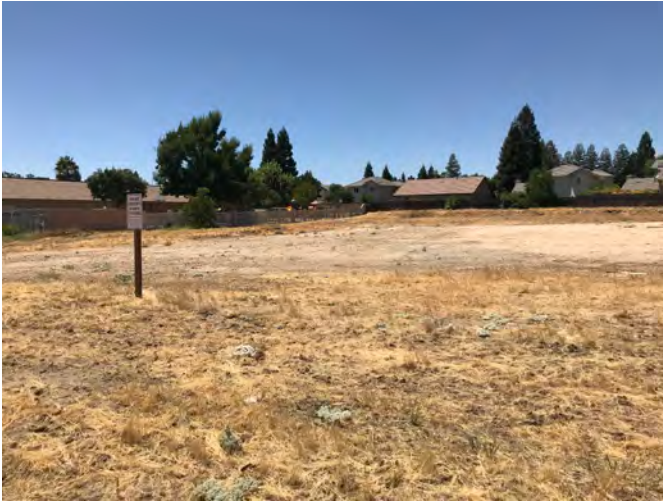
View of ruderal vegetation and bare ground at the eastern portion of the property, facing east. August 4, 2020.