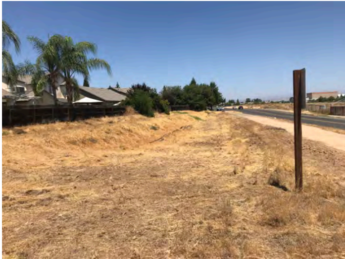
View of the property facing north, showing ruderal habitat. August 4, 2020.