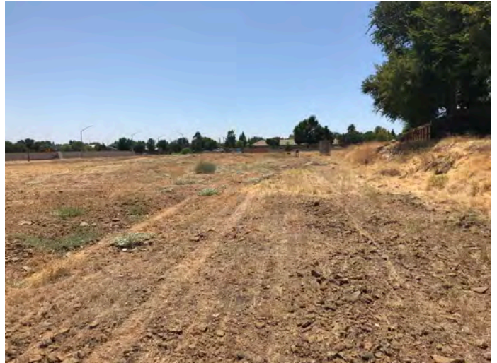
View of the property facing south, showing ruderal habitat and tire tracks. August 4, 2020.