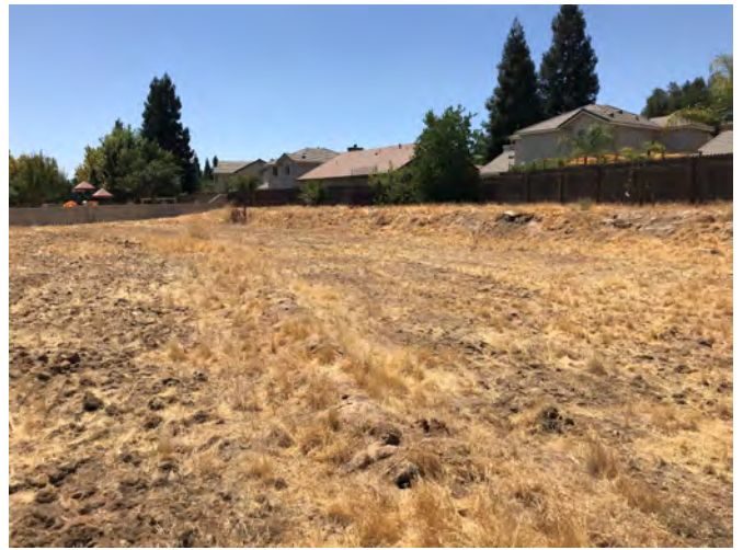
View of the southern portion of the property, facing southwest. August 4, 2020.