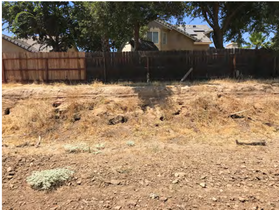
View of California ground squirrel burrows, facing west. August 4, 2020.