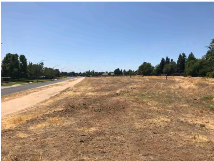
Overview of the property facing south, showing bare ground and ruderal habitat. August 4, 2020