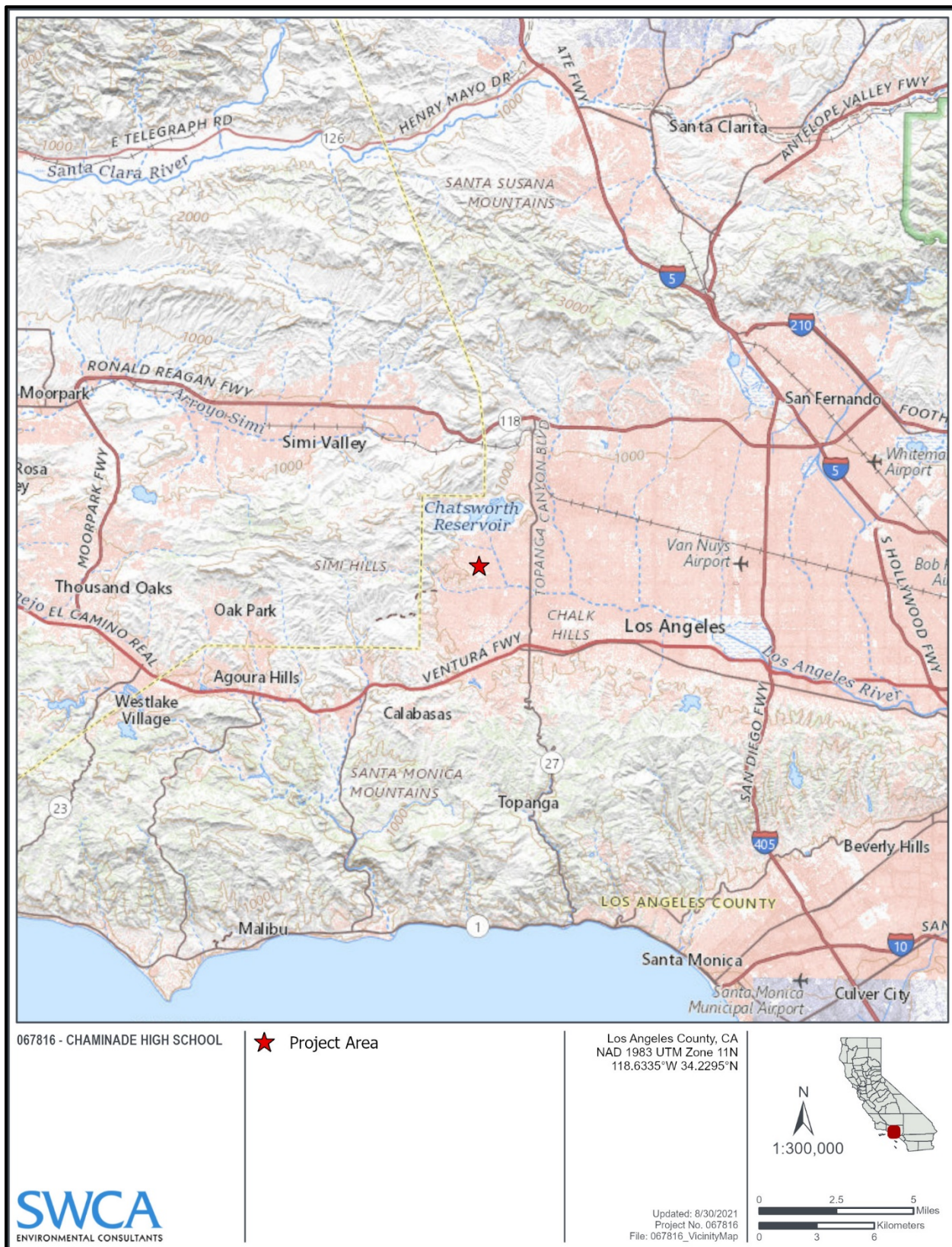
Figure 1. Project vicinity within the western San Fernando Valley of Los Angeles County.