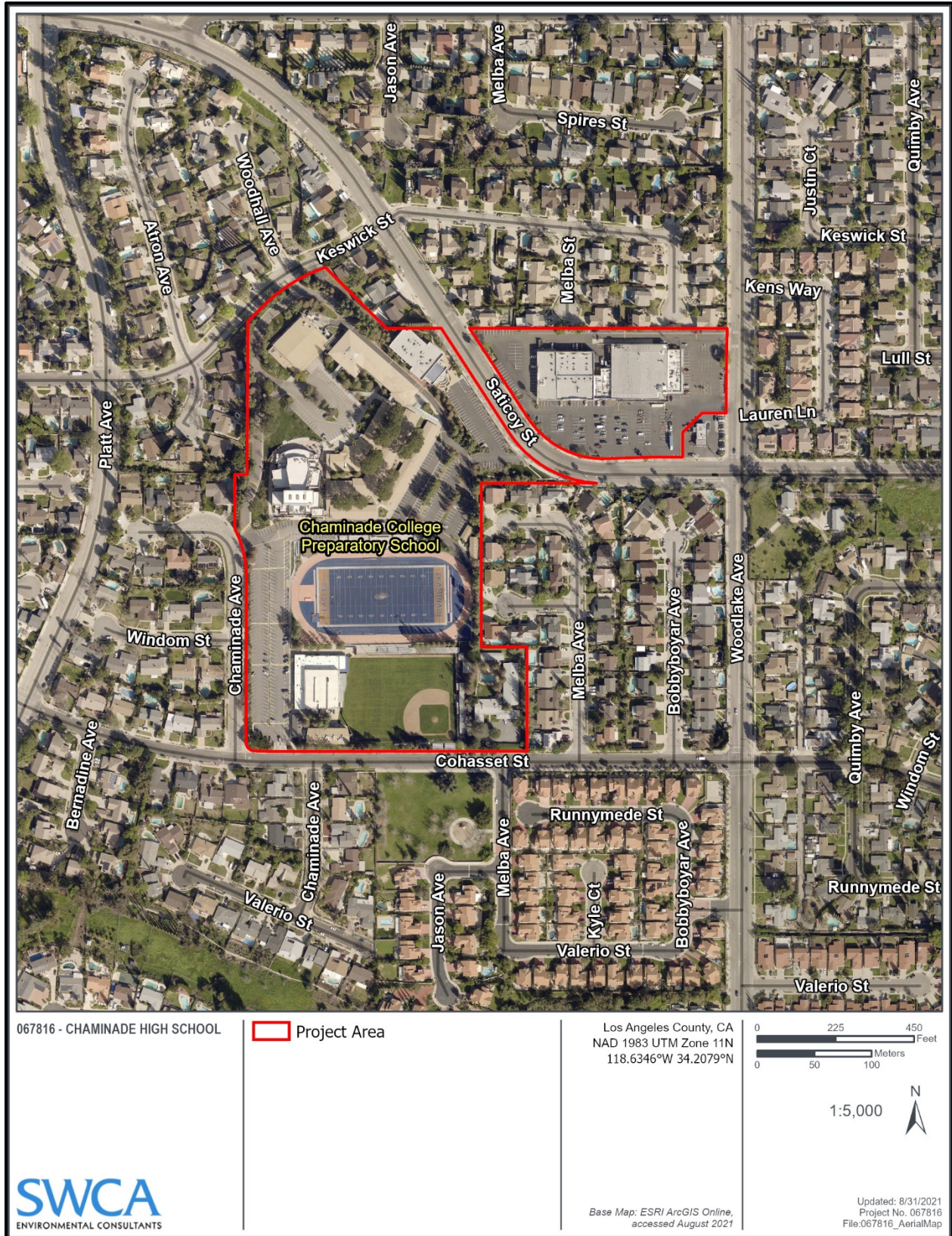
Figure 2. Project area plotted on an aerial photograph.